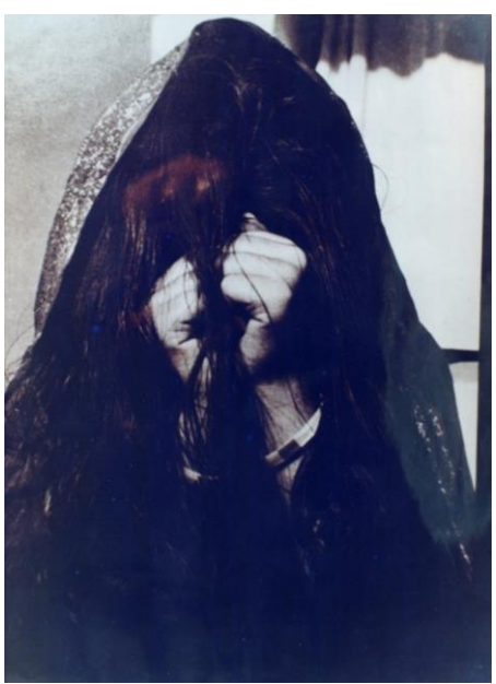
Caption. Figure 1. One of the photographs taken by Naib Uddin Ahmed (died 2009) founder supporter of DRIK (image also appears as front cover image of Rising from the Ashes: Women's Narratives of 1971, published 2013 ). The image is also reproduced in Saikia in her study of Women, War, and the making of Bangladesh (2011: 57) with the caption: 'Making Women Invisible'.

Yet the images provide remnants of presences that may demand justice: such as those of refugees streaming into basic camps in India, refugees many of which appear as walking corpses? Many, many of whom did not survive or if they did they did not return to the new Bangladesh. These images are a product but not in themselves proof (for they cannot trace back to intention) of a political decision that consequently renders millions of human beings (here mostly Hindu) homeless and stateless, beyond law and unwanted, their life/death irrelevant (or even desired as part of a process to cleanse East Pakistan of unwanted diversity). Here, as with figure 1, the presence of the universal human is signified but the idea of human rights and the recognition of the human as a value carrier in and of themselves is at the same time problematicised. Figure 1 may be termed the face of shame: it is a photo of a woman who has been victim of sexual abuse at hand of West Pakistani forces upon her release; there is no name and no face is visible.