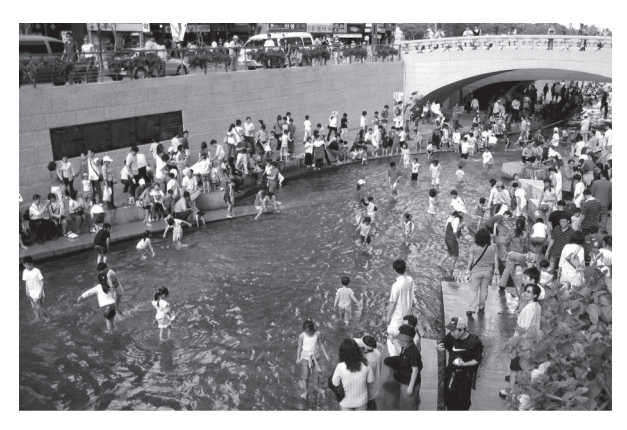
Image 2. Cheonggyecheon as new public space and tourist attraction in downtown Seoul.