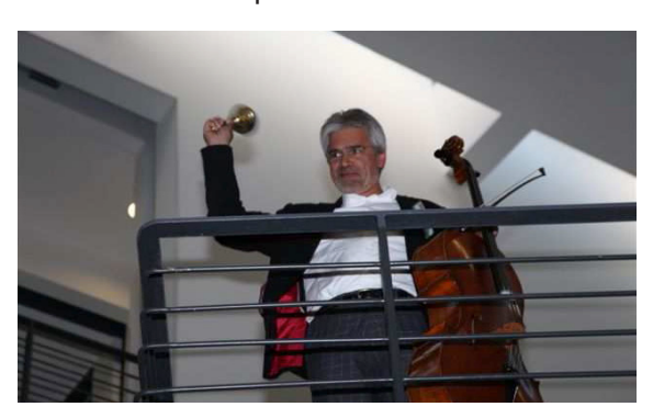
The 10th TMD-meeting was opened by a performance of the Purcell Consort Berlin.

is seen as a model for any developmental process in biology, there have been two COST-actions, through which the European Union has fostered and sponsored researchers all over Europe to create networks related to the topics "Odontogenesis" (COST-action B8, 1995-2001) and "Craniofacial Morphogenesis" (COST-action B23, 2001-2008). The TMD-congresses have been advanced very much from the impact of these COST actions.