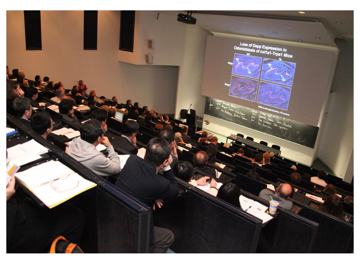
The presentations were excellent, thus the lecture hall was well occupied during the meeting.