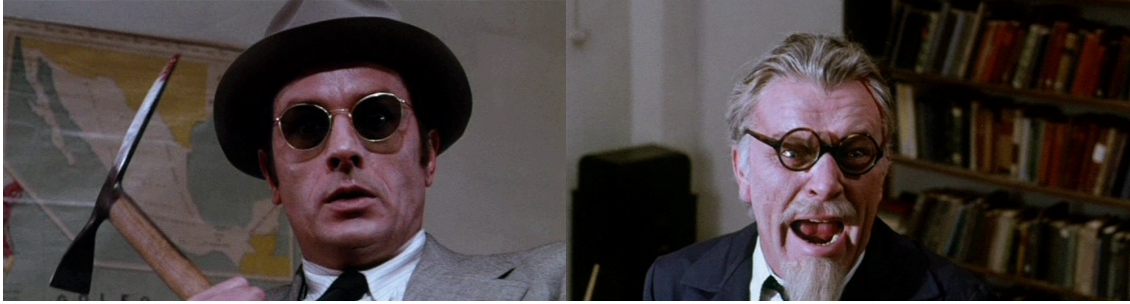
Left: Alain Delon as Ramon Mercader holds the ice axe with blood on its point after attacking Trotsky. Right: Richard Burton as Leon Trotsky rises up after being struck by the ice axe and screams at Mercader.

Trotsky attacks his assassin, and overcomes the assault long enough to allow Delon's capture. In the end of Losey's film, Delon is asked who he is, and he responds, "I killed Trotsky". The closeup on his bandaged head replicates that of the dead revolutionary, and becomes the freeze frame with which the film ends.