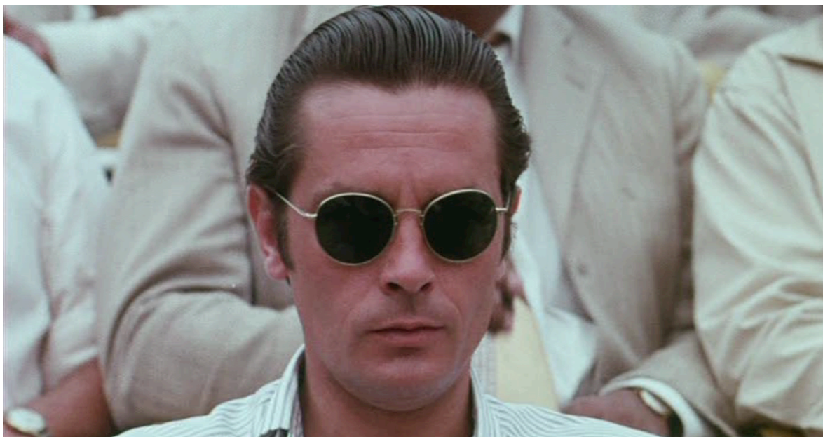
Alain Delon as Ramon Mercader sits emotionlessly behind his dark glasses.

The Mercader character as acted by Alain Delon is very differently constructed. Delon and Losey collaborated to produce an icy, enigmatic figure, often hidden behind dark glasses that distance him from both the audience as well as the other characters.