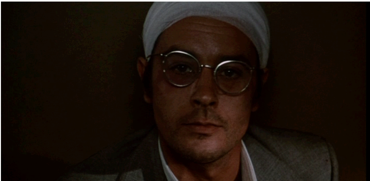
A freeze frame of Alain Delon as Ramon Mercader after he has been captured.

Trotsky attacks his assassin, and overcomes the assault long enough to allow Delon's capture. In the end of Losey's film, Delon is asked who he is, and he responds, "I killed Trotsky". The closeup on his bandaged head replicates that of the dead revolutionary, and becomes the freeze frame with which the film ends.