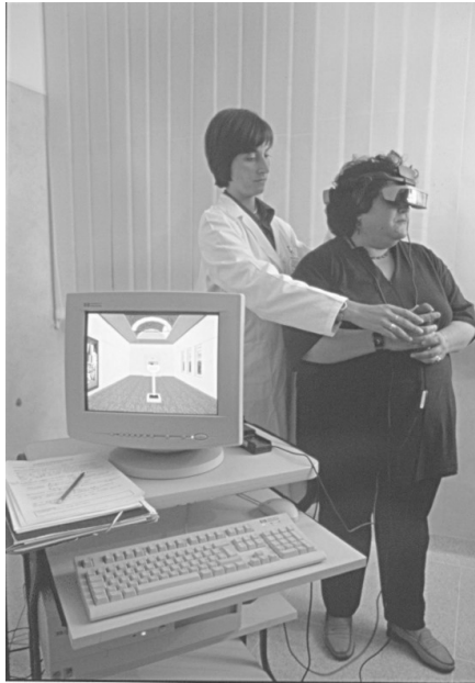
Figure 1: An immersive Virtual Reality system used for the treatment of obesity

have experienced double-digit growth both worldwide and in the United States since the turn of the century, and the 2010 US market for virtual reality in surgery, medical education, therapy and other areas will grow to $290 million, according to a new report from research firm Kalorama Information (Heffner, 2007).