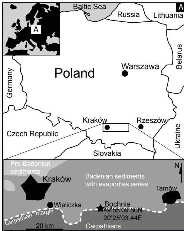
Figure 1. Map of Poland showing the location of the Bochnia Salt Mine (marked with asterisk on the enlarged part).

present a model showing how these cytoplasm could have been preserved and iii) to indicate how the presence of fossilized cytoplasm affects the interpretation of plant assemblages.