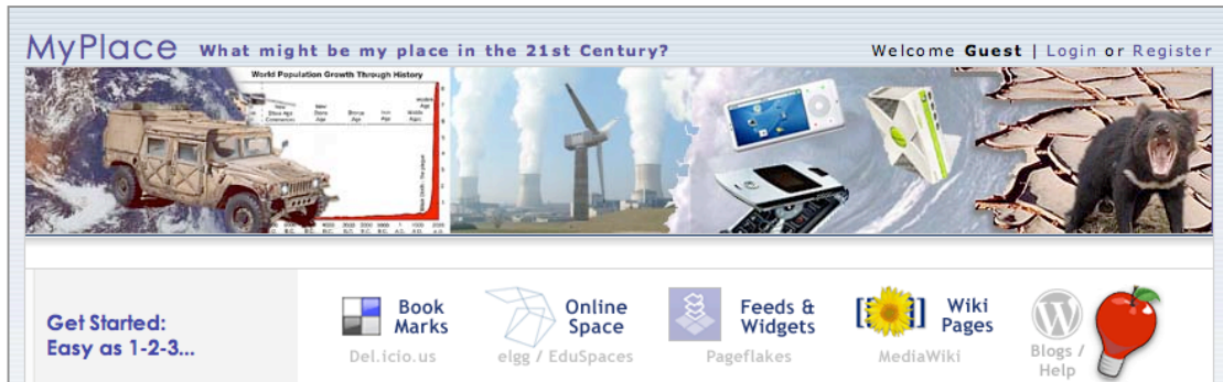
Figure 2 – Entry of the MyPlace Project

Clearly a compelling topic demonstrates a hallmark of the WebQuest, however, in order to accommodate the openness necessary to encourage intrinsic motivation and a culture of thinking, the format presents options within a series of structures. These structures and the associated Web 2 applications are described below.