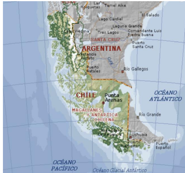
Map 1 Influence area of city-port of Punta Arenas (Century XIX and first decades of XX)