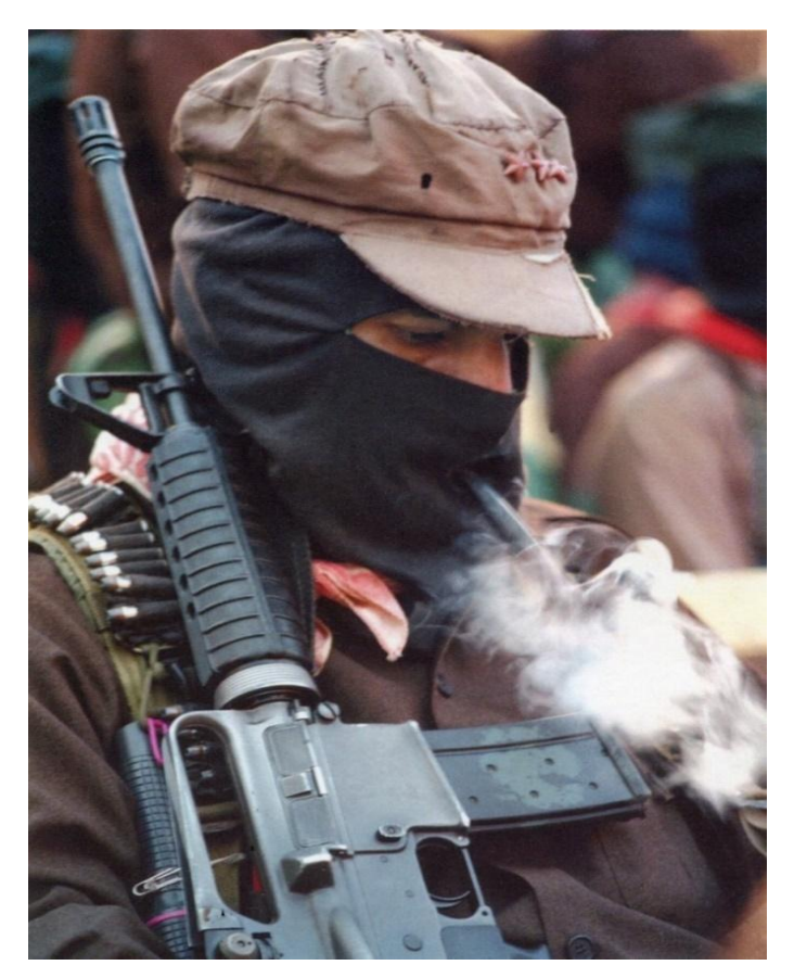
[Fig. 5]. Subcomandante Marcos.

this portrait of Marcos provides only a fragmentary and almost furtive view of him. It is in a photo—and many others that portray Marcos in a similar way—that Marcos is indirectly perceived and not fully viewed. This discloses a mystical aura around him, which is further accentuated by Indigenous stories and myths, one of which is the Votán-Zapata.