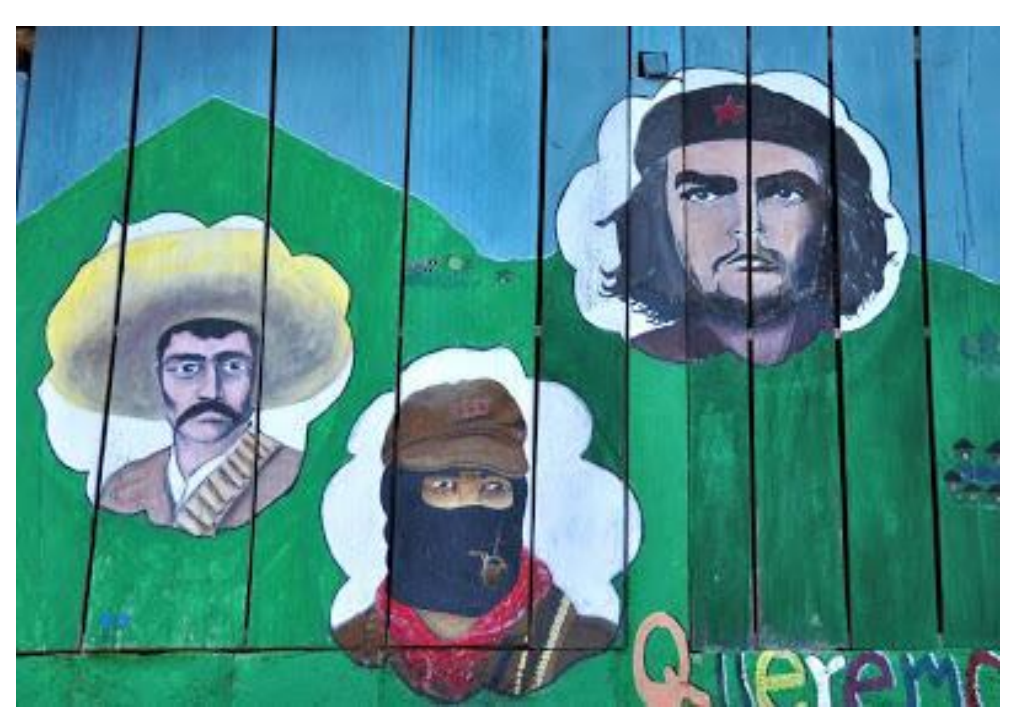
[Fig. 2]. Mural on the wall of a middle-school building of the Zapatistas in caracol Roberto Barrios. Roberto Barrios, Chiapas, Mexico, December 12, 2015.

The Zapatistas have intentionally revived iconic revolutionary combatants to emphasize the strategic armed rebellion and to provide a critical stimulus to at least twenty years of struggle by diverse Indigenous peasant organizations at local, municipal and regional levels. In the Zapatista communities, it is typical to see images of Che Guevara, Emiliano Zapata, and Marcos next to each other on community murals where they represent a trinity of revolutionary symbols: Che Guevara, the military commander of Marxist guerillas; Zapata, the symbol of warfare for agrarian revolution; and Marcos, a masked persona representing the EZLN both as an army and as a political collective (figure 2). By situating themselves among the armed struggles in Latin America, the Zapatistas call attention to the direct action of guerilla warfare as a part the continuity of the struggle against imperialism, on