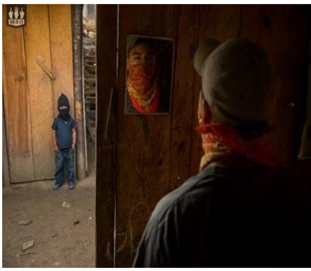
[Fig. 4]. Zapatista man wearing a paliacate. Photo: Tijen Tunali in Oventik, Chiapas, Mexico, December 12, 2009.

Indeed, Zapatismo's vision of revolutionary subjects always has a dual connotation: one in the plural as embracing all the oppressed people and one that calls for a micro revolution in your own life and your own home as ordinary men and women. Zapatistas declare to be you so that you can recognize your own revolutionary subjectivity. According to Zapatismo, there is no single historical subject imbued with revolutionary potential; rather, we are all capable of imagining, building, dreaming, and living revolution.