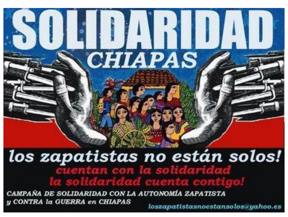
[Fig. 3]. Anonymous, Solidaridad Chiapas [poster], 2010. Photo: Tijen Tunali in San Cristobal de las Casas, Chiapas, Mexico, January 10, 2014.

2014, the image was carried as a banner to represent solidarity with the movement. In the Zapatista cooperatives, this image—among the works of other artists—was available for the tourists to take with them to their own countries in exchange for a small donation. Featuring a typical representation of Zapatista aesthetics that mixes folkloric and dreamlike sensibilities with a realistic representation of the world, the poster calls for solidarity with the Zapatista movement.