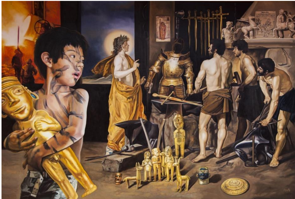
[Fig. 3]. Richard Peralta, En casa del herrero , 2015. Oil on canvas. 190 x 130 cm.

of the ancient creatures by an infidelity forged from the Spanish Conquest of Peru. 20