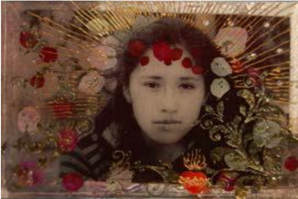
[Fig. 1]. Edwin Quispecuro Nina, Misky Warmi , 2016. Mixed media layered in resin: photograph transparency, gold leaf, oil, bougainvillea flowers. 20 x 30 cm.

earth goddess Pachamama, and as embodying puriy in the in-stilled presence of the portrait within the stony yet translucent work.