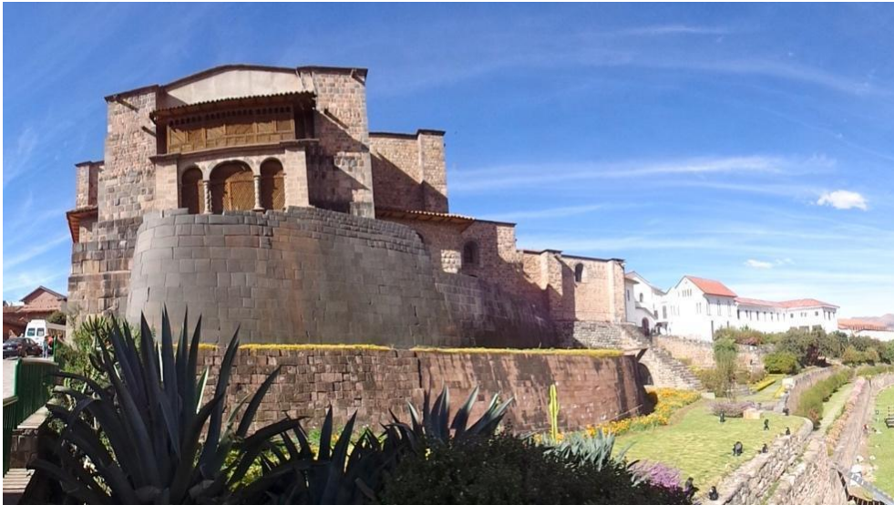
[Fig. 4]. Koricancha-Santo Domingo, Cusco, 15 th -16 th centuries.