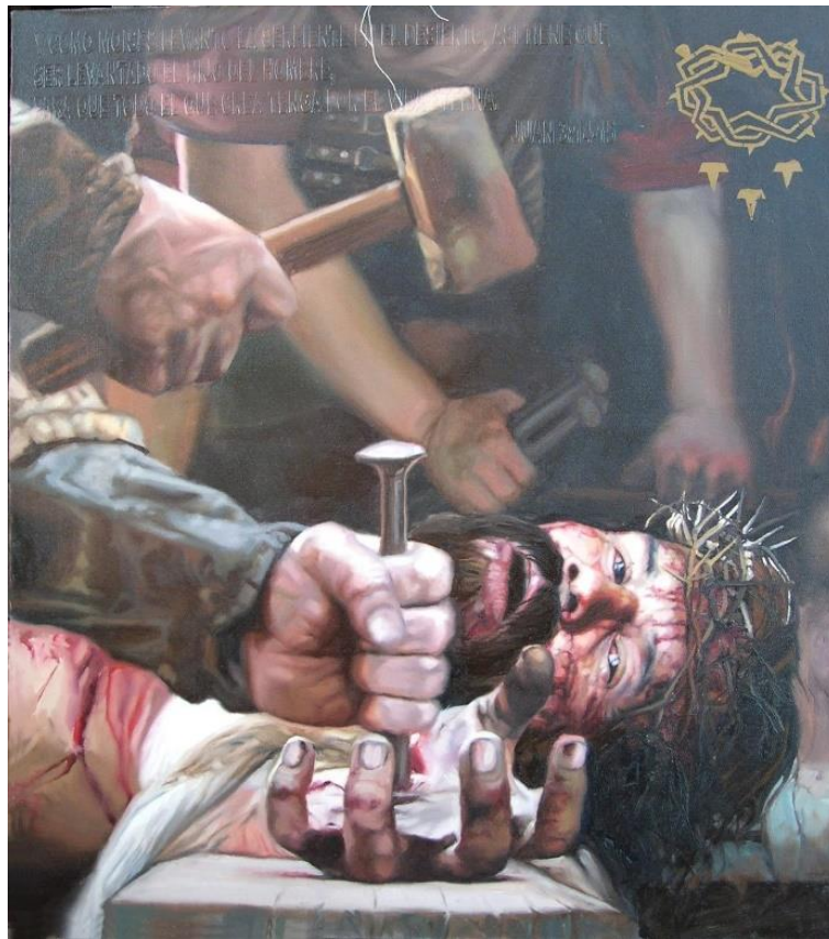
[Fig. 5]. Richard Peralta, Cristo Clavado en la Cruz , 2009. Church of Santo Domingo, Cusco.

the religious imagery of the past. The scenes both reach back into biblical times and project into the present; the use of photographic realism to depict the scenes transports the viewer back and forth in the presence of a sacred space, and in one of the primary tourist destinations.