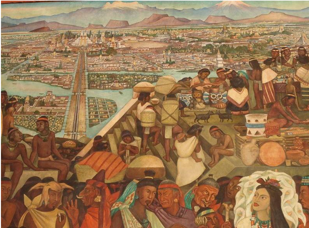
[Fig. 10]. Rivera, Diego. (1945). La gran Tenochtitlán [mural].

peoples had been converted into “living fossils” or atemporary subjects with no say in contemporary Mexican national life (figure 11). 34