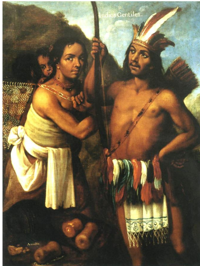
[Fig. 5]. Cabrera, Miguel. (1763). 16. Indios Gentiles [painting].

organize the “scientifically” legitimated differences between races. In the space and sequence of the pictorial format, these hierarchies took on an explicitly visual form. In most of the casta series, the first painting demonstrates the mixing of the male Spaniard and the female Indian, giving the white Spaniard pride of place as the initiator of the series, hence confirming the racial patriarchal hierarchies established in the colony. Concurrently, the image of the “wild” Indian living on the fringes of society persisted (figure 5), legitimating the perpetuation of the civilizing mission that sought to incorporate the marginalized peoples into a burgeoning, soon-to-be mestizo nation.