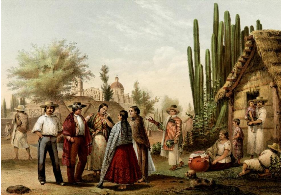
[Fig. 6]. Castro, Casimiro. (1855). “Trajes típicos de mexicanos en una escena rural a las afueras de la Ciudad de México” [engraving], from México y sus alrededores . Colección de monumentos, trajes y paisajes dibujados al natural y litografiados por los artistas mexicanos.