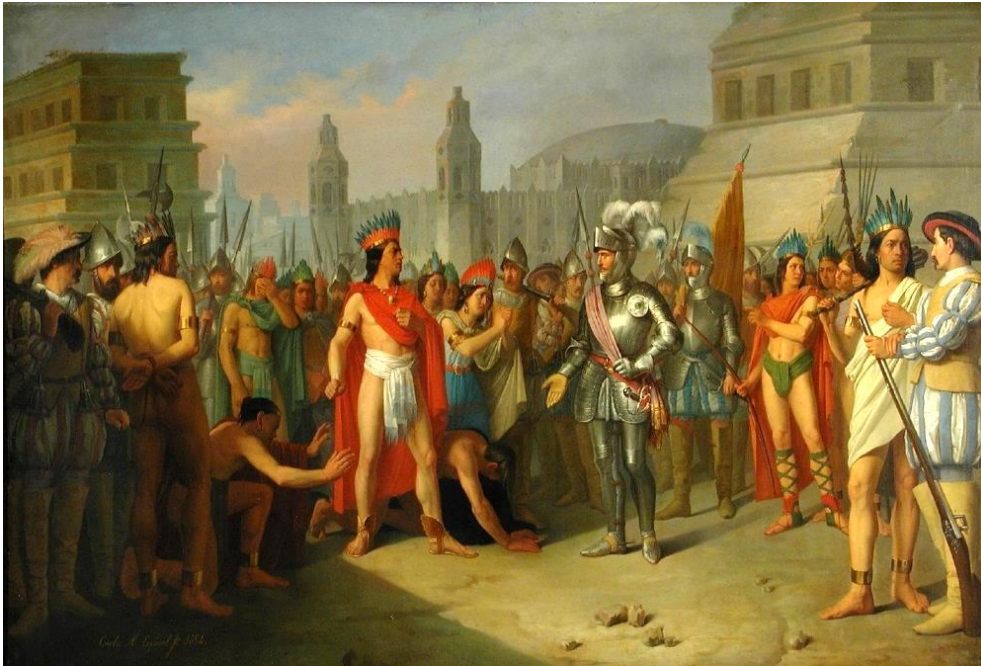
[Fig. 8]. Esquivel y Rivas, Carlos. (1854). Prisión de Guatimocín, último emperador de Méjico [painting]. Source: Wikimedia Commons under Creative Commons Attribution-Share Alike 4.0 International licence.