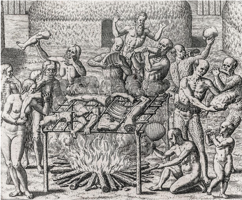
[Fig. 2]. de Bry, Theodor. (1562). Cannibalism in Brazil in 1557 as Described by Hans Staden [engraving].

systems, which sought to incorporate the originary peoples into the nascent governing systems of the colony.