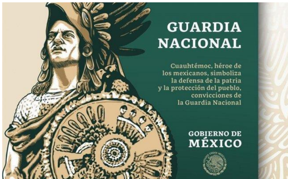
[Fig. 12]. Guardia Nacional [National Guard]. (2019).

So the temporalities remain askew. On the one hand, there is a continuous effort to try to keep “the Indian” in the past (here I am referring to what Johannes Fabian has theorized as the denial of contemporaneity or coevalness 41 ), all the while the rhetoric of the civilizing forces persists in the discourse of modernity/coloniality. Indigenous peoples in Mexico are still denied an effective agency in the matters of national policy yet there remains an absolute negation of acknowledgment—a disavowal—of their importance as effective political agents.