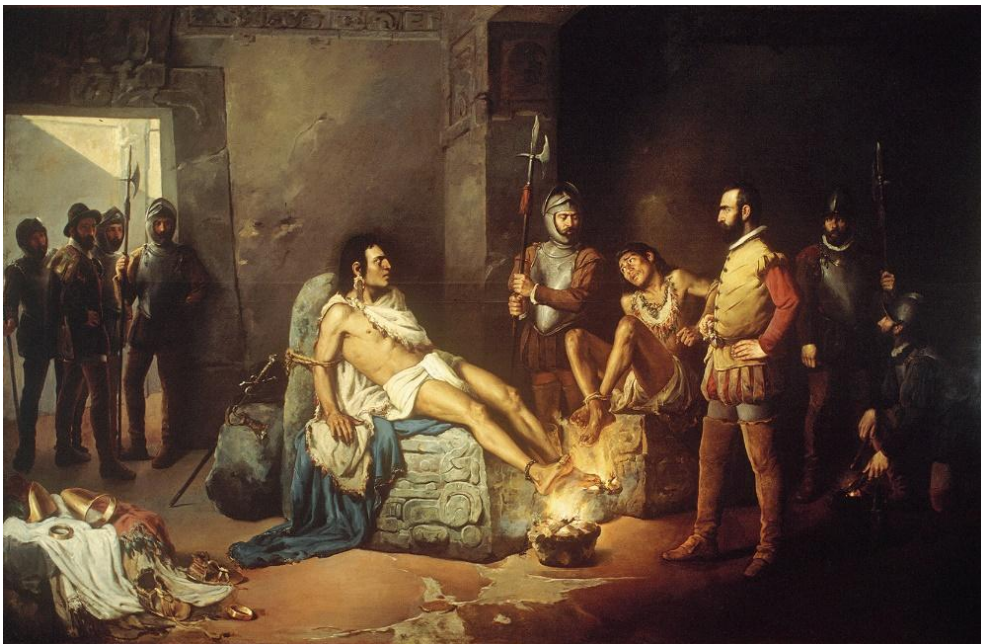
[Fig. 9]. Izaguirre, Leandro. (1893). El suplicio de Cuauhtémoc [painting].