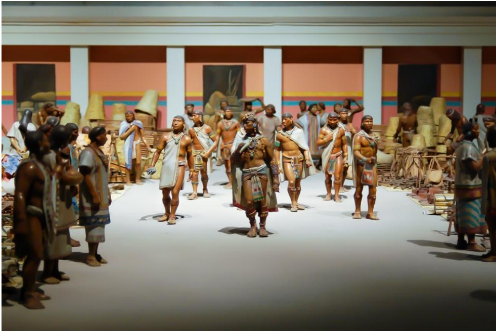
[Fig. 11]. Diorama at Museo Nacional de Antropología e Historia [National Museum of Anthropology and History], 2010.

in the nation-state. The night that the North American Free Trade Agreement came into effect on New Year’s Day, the Zapatista Army for National Liberation (EZLN) rose up in arms in the Mexican state of Chiapas. Formed by several Indigenous groups hailing from the region (Tzetzales, Chontales, Tzetziles, Choles, Tojolabales), the neo-zapatistas positioned themselves politically against the supposed modernization of Mexico and the neoliberal economic policy imposed by the regime, as represented by the implementation of NAFTA. For their spokesperson subcomandante Marcos, the EZLN had decided to rise up in arms because NAFTA was a death certificate for the [Indigenous] groups of Mexico. The implementation of neoliberalism in Mexico was, for the neo-Zapatistas, only a new and more intensive stage in “the historical crime of the concentration of privileges, riches and impunity” brought on by colonialism. In one evening, the neo-Zapatista insurgency brought down the globalizing and First Worldist discourse that the Salinas government