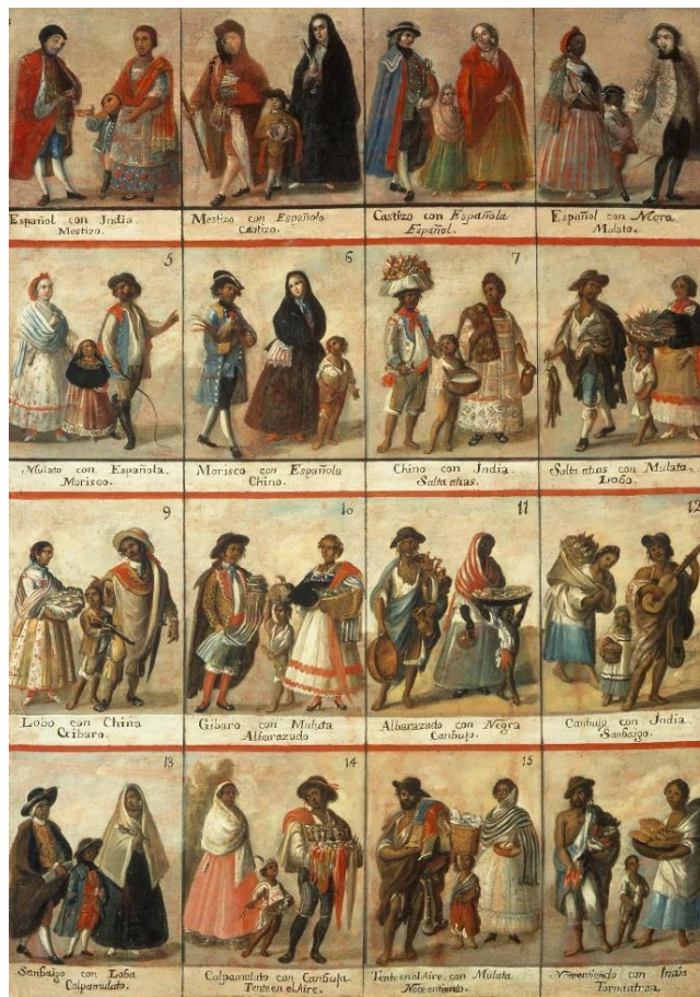
[Fig. 4]. Unknown artist. (18th century). [Casta painting containing complete set of 16 casta combinations].

privileges of the colonial elite, this genre permitted miscegenation in New Spain to be fixed and produced as an object for scientific inspection. As in all taxonomic enterprises, hierarchies were deployed in order to