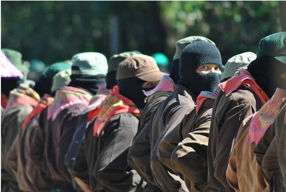
[Fig. 13]. Osornio, Mariana. (2017). Te miro [I See You] [photograph]. Source: Wikimedia Commons under Creative Commons Attribution-Share Alike 4.0 International licence.