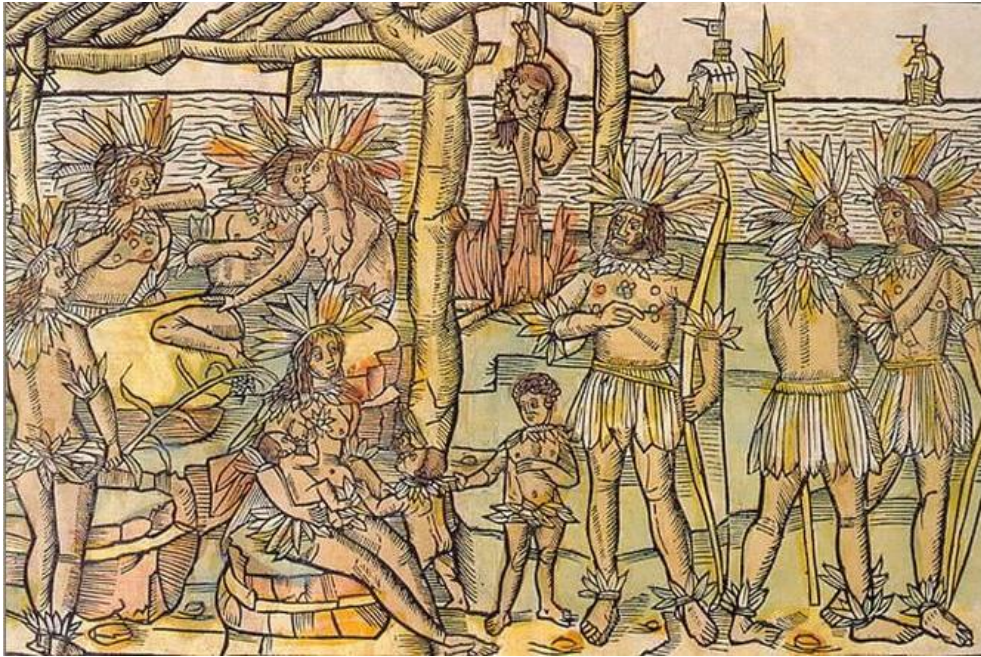
[Fig. 1]. Froschauer, Johann. (1505). “First Known Depiction of Cannibalism in the New World” [engraving], published in Mundus Novus by Amerigo Vespucci.

ed an economic use for the Amerindian “cannibal”: