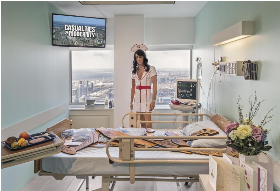
[Fig. 1]. Kent Monkman, Casualties of Modernity , 2015. Mixed media installation. Collection of the National Gallery of Canada.

the hospital bed whose form is inspired by Picasso's Les Femmes d'Alger (O. J. R. M.) (1907) and who is attached to an electrocardiogram machine that monitors her heartbeat with intravenous drips connected to her arms.