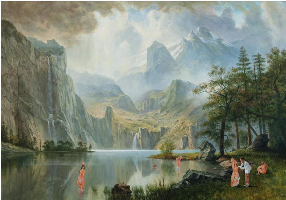
[Fig. 8]. Kent Monkman, Empathy for the Less Fortunate , 2011. Acrylic on canvas.

the nudes. But is the figure standing for Indigenous women, the female nude in Western art or, indeed, painting itself? In other words, to whom is Miss Chief bringing the solace of Indigenous knowing, being and spirituality that she has made it her mission to deliver? And how is she negotiating the prevalent saviourism/appropriation tango inherent in coloniality?