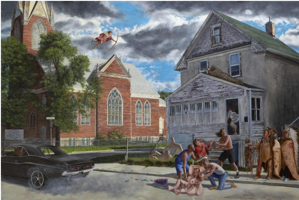
[Fig. 7]. Kent Monkman, Death of the Female , 2014. Acrylic on canvas.

centre of action, who has been ejected from the black car that is shown speeding away. A group of Indians dressed in traditional outfits based on portraits by George Catlin are oblivious to the plight of the female. Striking grandiose poses they gaze into the distance as if they were looking out over the prairie or had walked straight out of a film set or museum diorama. Their aloofness declares them to be ‘unreal’ cardboard cut-out figures in contrast to the contemporary Indigenous men, who, unglamorously clad in T-shirts, shorts and jeans, come to the aid of the stricken female, a contrast that adds further nuance to the themes of indigeneity, modernity, and care of Miss Chief’s Lady Di impersonation. Moreover, as Miss Chief explains, the Cubist-inspired fragmentation of the female body in this image references the violence against Indigenous women and the female spirit in the modern period: