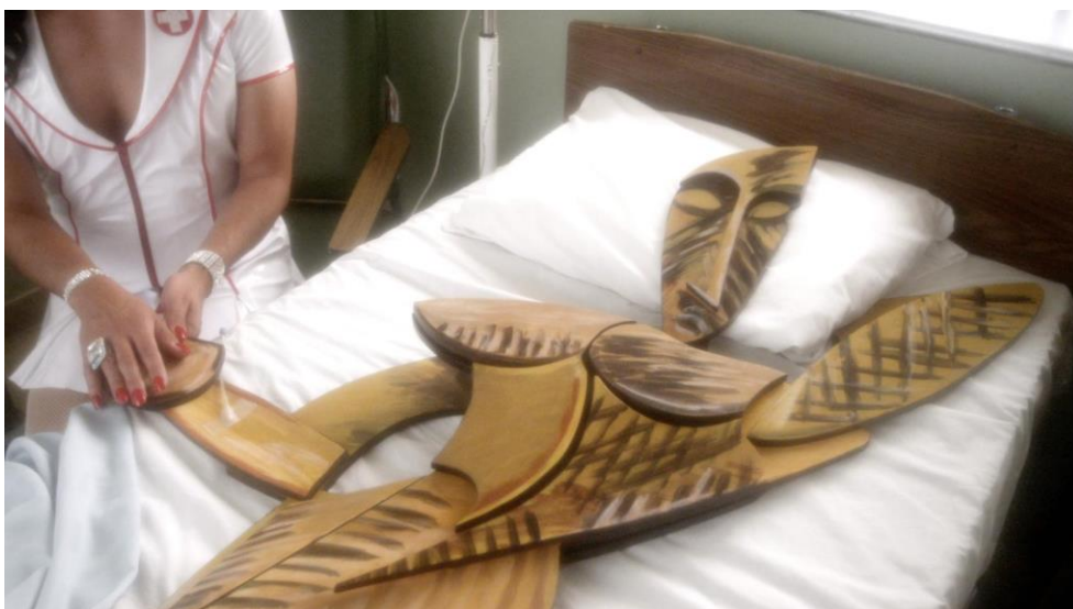
[Fig. 2]. Kent Monkman, Casualties of Modernity , 2015. Video still. Collection of the National Gallery of Canada.