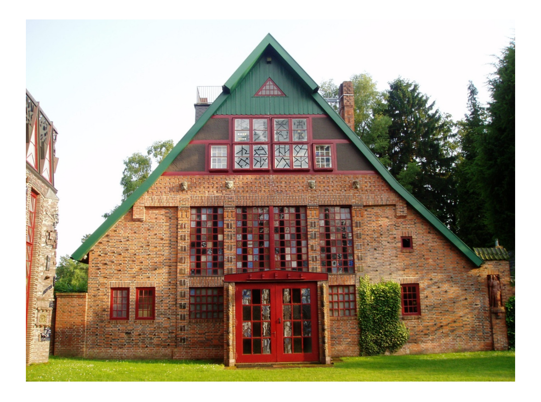
[Fig. 1] Johann Michael Bossard, The Artist's Residential and Studio House seen from the North , 1912-14. Kunststätte Bossard, Jesteburg.

Its low roof, the gable with the timber cladding, the bricks and the colour scheme of red, white and green are reminiscent of the traditional architecture in the region and remind us of a typical farmhouse in Lower Saxony, while the large, north facing windows, the architectural sculptures and the wasters—the deformed bricks he incorporated into the façade—reveal the artist's home.<sup>4</sup>