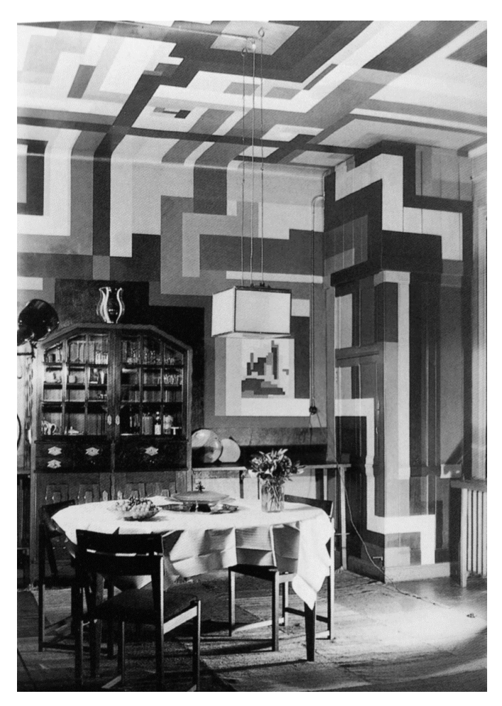
[Fig. 6] Wenzel Hablik, Dining Room in Hablik's Villa , 1923, photographed around 1926. Wenzel-Hablik-Foundation, Itzehoe.

of colour bands of diverse length and width. In a strictly right-angled composition these bands of fourteen different colours run through the whole room, crossing each other in a transparent or opaque way, transitioning seamlessly from the walls to the ceiling and over the door leaf. Whereas his earlier contract designs followed a certain rhythm, Hablik relinquished here —for the first time— any hint of perceptible order or repetition. Yet, at some points the asymmetrical bands of colour follow the outline of the furniture as can be seen on a historical photograph where the solid Gründerzeit cupboard is framed by a wide black stripe.