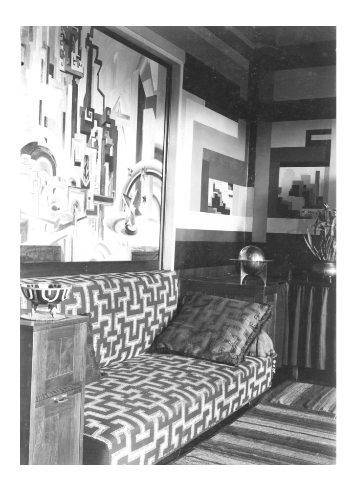
[Fig. 7] Wenzel Hablik, Dining Room in Hablik's Villa with the Oil-Painting 'Große bunte utopische Bauten' , 1923, photographed around 1923.

At other places the colour bands form representational shapes. For example, the bands can be squeezed to smaller lines and forms that remind us of an abstract painting hanging on the wall, just like the area next to the cupboard, underneath the rectangular lamp where lines are compressed together. Another example is the large red shape that rises from behind the stove he designed to the ceiling. It can be interpreted as the visualization of the heat produced here. In this way the representational shapes seem to link the wall painting to the objects in the room.<sup>14</sup>