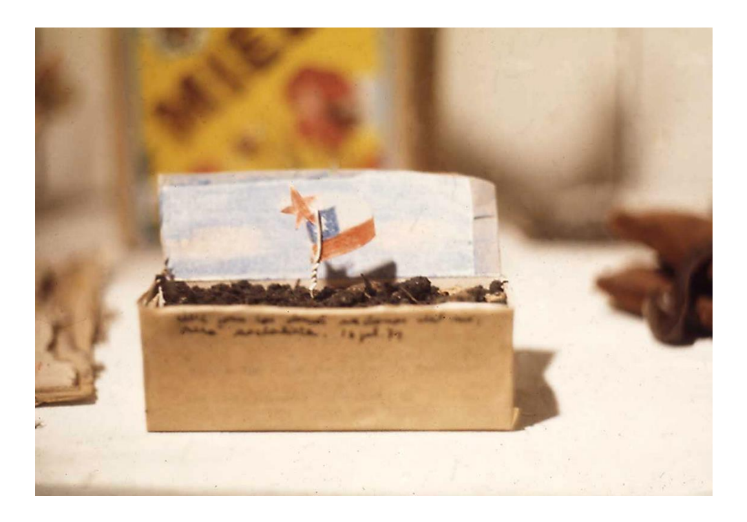
[Fig. 2] Cecilia Vicuña. Cajita e' tierra, from Journal of Objects from the Chilean Resistance. London, June 24-1973-August 1974. Mixed media, cardboard, soil, wire, paint. Courtesy the artist and Lehmann Maupin, New York and Hong Kong.

"Another of the objects," wrote Cecilia, "is Chilean soil that I took to London: a drawn flag tied to a wire. I put it in the ground. All in a little box with a text." In this case, it seems to me that the "threatening intrusion" of absence, painful separation and displacement—signified here by the desire, affection and visceral belonging condensed in that little portion of Chilean earth—is somehow brought into expression by its suturing into the artwork.