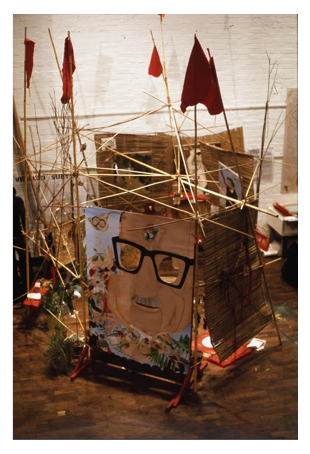
[Fig. 4] CECILIA VICUÑA. Ruca Abstracta or Allende's Eyes, 1974. Site-specific installation. Installation view, Arts Festival for Democracy in Chile, organized by AFD at the Royal College of Art, London, October 14, 1974.