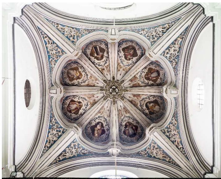
Figure 2. Church of San Andrés (Seville)

General image of the mural paintings at the Church of San Andrés (Seville).