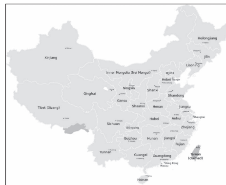
Figure 03. Provinces of PR China.

Frequently, the land reclamation involves urban plans in a big scale in order to promote their approval as they are associated with great expansion of land with strong impacts. Rarely those plans are strictly followed since they serve as "marketing" promotions and not as a help to increase the cultural or social values of communities. Urban plans are strongly dependent on a enormous variety of political and economical issues that restraint the application of the urban plan regulations.