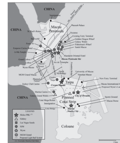
Figure 09. Macau land reclamation and casinos map.2008. Author's adapted map.

Land reclamation was used to promote and develop all those projects that help the economy to grow. Some income and profits were also generated by selling the new land conquered to the water but this is the bright side of the coin if we don't mention other aspects such as the environmental one.