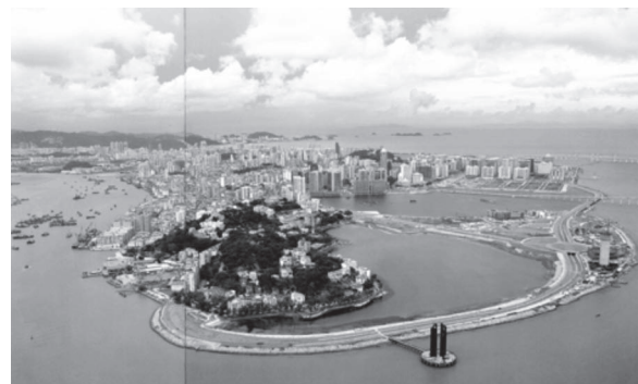
Figures 07 and 08. Macau land reclamation aerial photos. 1960 & 1999. Author's adapted photos

After the handover in 1999 the political situation in Macau had change, but not until the year of 2002, the city was not having big changes in terms of its architecture and urban design. The majestic changes happened after the gambling liberalization that completly reshape the water front of Macau and unified the two islands in a huge area called Cotai.