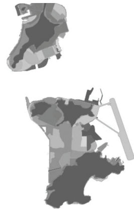
Figure 06. Macau land reclamation evolution map. 1912-2008.

■ As we have seen Macau's historical patterns are a sample not only in the context of Pearl River Delta, due to its long testimony at the confluence of Eastern and Western values, but also as an important reference of land reclamation structured urban historical city.