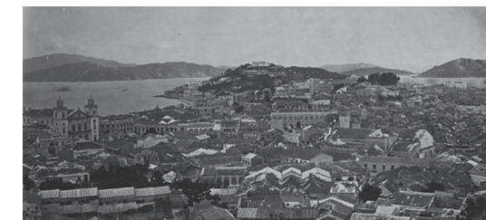
Figure 05. Macau panoramic view on the early years of the twenty century. http://www.facebook.com/groups/26556752554/#!/groups/26556752554/photos

Macau is original in its architecture: combining Portuguese and Chinese architectural and structural elements in its civil and religious buildings (both Portuguese churches and Chinese temples). It is a unique sample in PRC and in the world. Macau is also unique in its cultural aspects: linguistic, social, anthropological, etc.