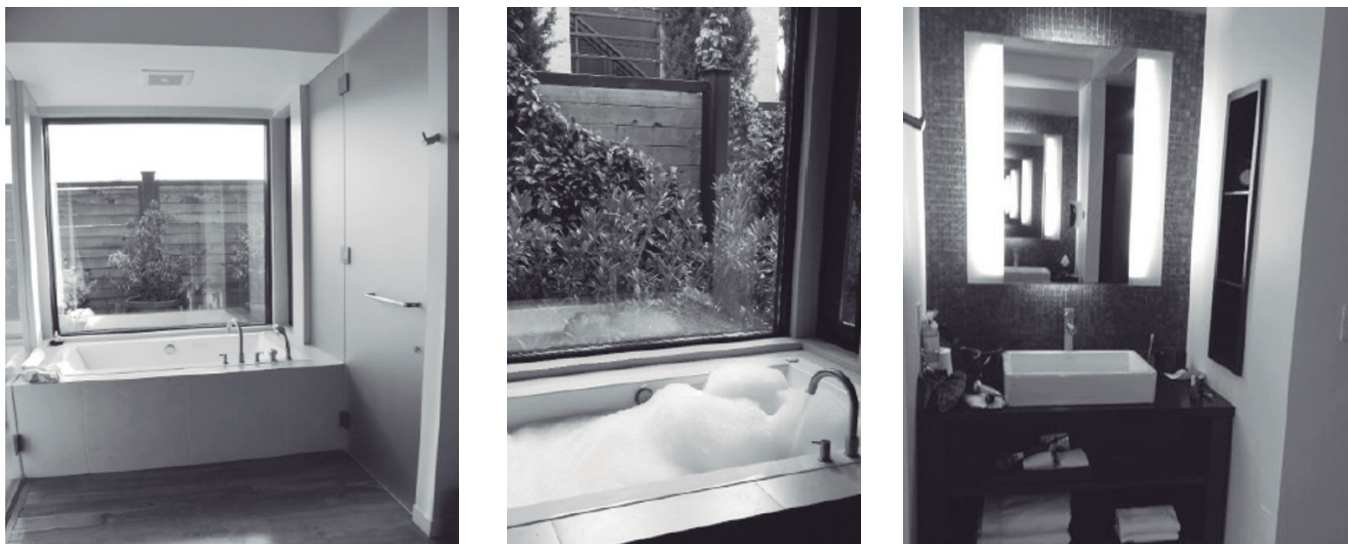
Figure 1-2 Bathtub-outside views-natural light. Hotel Bardessono Figure 3. Mirror-artificial light. Hotel Bardessono