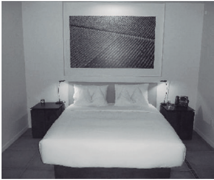
Figure 4 Environmental design (a) Figure 5 Environmental design (b) Figure 6 Views to outside (city/mountain)