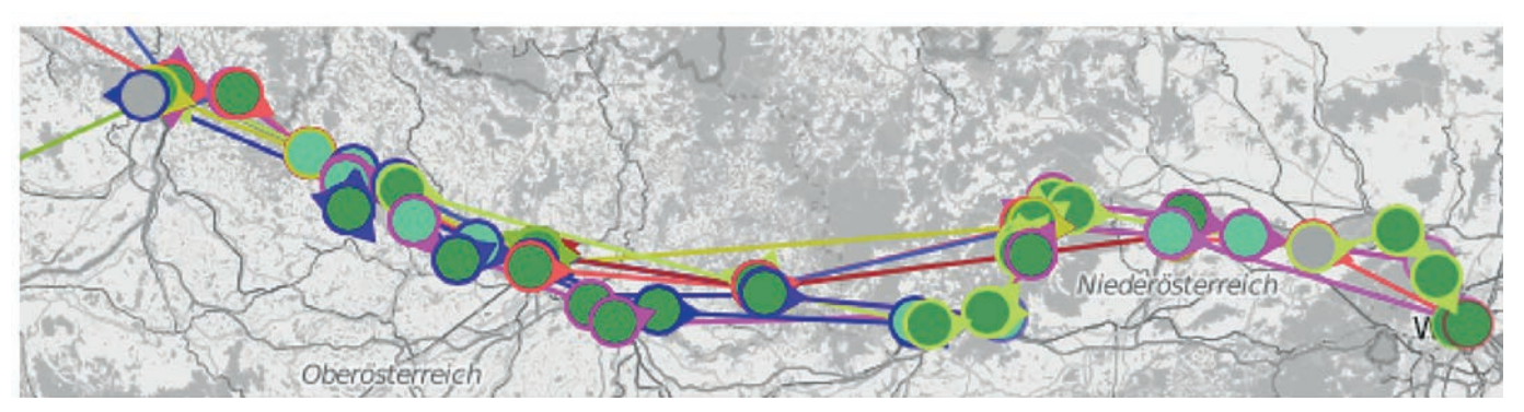
Figure 2 Visualization of all touchpoints along the Danube cycle path (Data visualisation from ExperienceFellow tool, 2016)