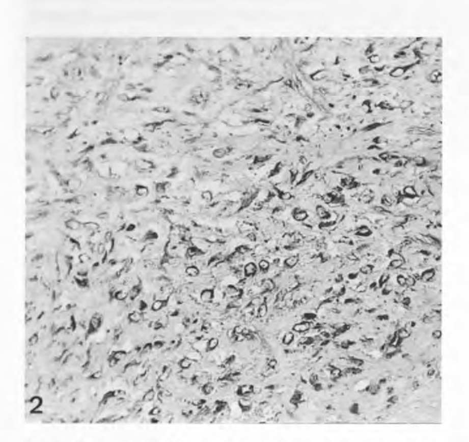
Fig. 2: Vimentin in fibroblast cells of a dental pulp section, previously stained with hematoxylin-eosin. × 250. Fig. 2: Présence de vimentine dans des fibroblastes pulpaires colorés préalablement avec hématoxyline et éosine. × 250.

Fig. 1: Expression de l'antigène S-100 dans une section de tissu salivaire colorée au préalable avec hématoxyline et éosine. Un faisceau nerveux est marqué positivement par l'anticorps dirigé contre la protéine S-100. × 400.