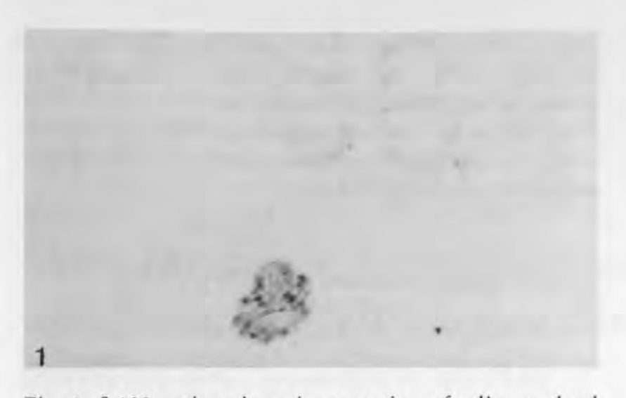
Fig. 1: S-100 antigen in a tissue section of salivary gland previously stained with hematoxylin and eosin. Nerve bundle showing a positive immunostaining for S-100 protein antigen is visible. \times 400.

Fig. 1: Expression de l'antigène S-100 dans une section de tissu salivaire colorée au préalable avec hématoxyline et éosine. Un faisceau nerveux est marqué positivement par l'anticorps dirigé contre la protéine S-100. × 400.