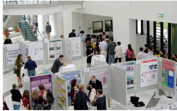
Discussing science while eating and drinking: Ideal surroundings for a symposium.