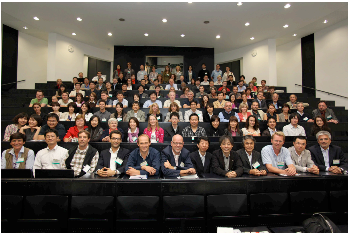
Group photo of all of the participants of the 10 th TMD in Berlin, Sept. 1.-4, 2010.