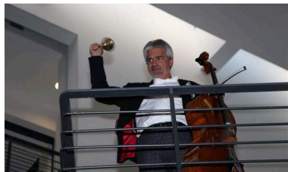
The 10th TMD-meeting was opened by a performance of the Purcell Consort Berlin.