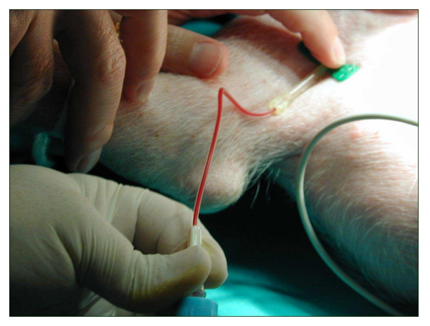
Figure 5. PRP, obtained via the femoral artery (located previously by the attending veterinarian), is used and collected in 5 ml citrate tubes (4 tubes/animal).

PRP was routinely obtained by femoral bleeding, and no incidents were reported (Fig. 5). Bone marrow was collected through sternum trephination (Fig. 6). Some complications appeared in pig number 4, being necessary to