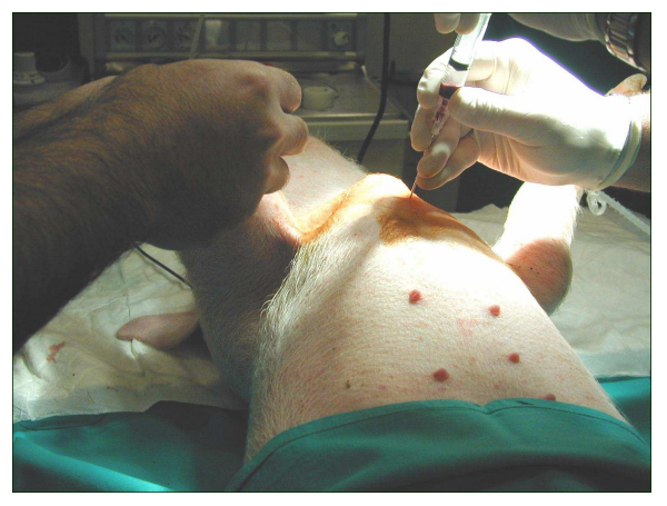
Figure 6. Bone marrow is obtained by sternum puncture, which is a less traumatic procedure than puncture of the crista iliaca. 3 to 5 ml of bone marrow are obtained per puncture. Only one of the experimental subjects presented some difficulty for collection of the bone marrow; 3 punctures were required in this case.

make three punctures. However, the animal did not show additional post-surgery complications. In conclusion the hybrid pig constitutes a convenient experimental model in dentistry, with very few limitations for the applications herein assayed. Moreover, the external surgical approach technique turned out to be useful to do perforations in the mandible in order to place the regeneration material.