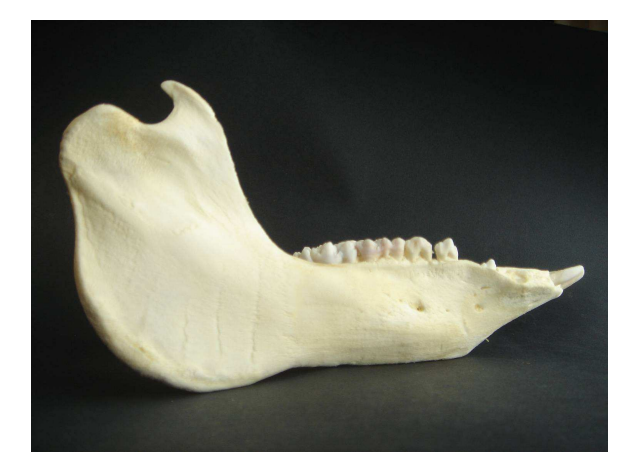
Figure 1. Lateral view of the mandible of a five-month old pig

All the animals used in the study received the analgesic and antibiotic protocols established by the rules and regulations of the animal services in which the animals were maintained. All of them ate normally between 1 and 3 hours after surgery and gained weight adequately. One of them died a few hours later as a result of postoperative complications. Another presented a small abscess, which was debridate (Fig. 1).