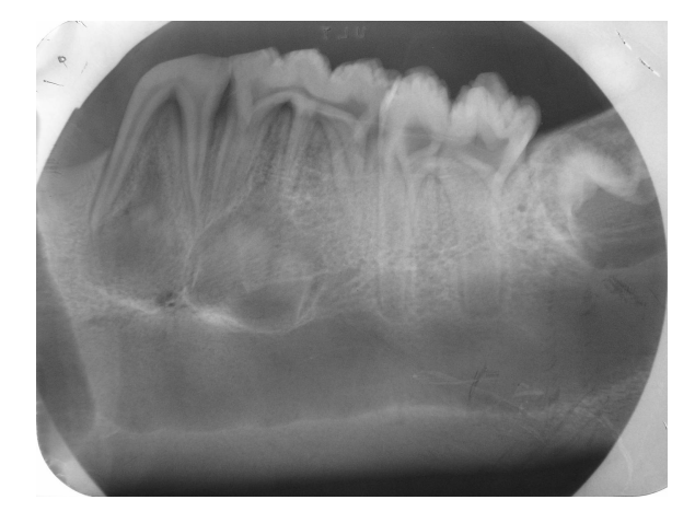
Figure 2. Radiography of the mandible of a five-month old pig.

up by the dental germs in an age-dependent fashion, which results in reduced available space for material implantation. The coincidence of these anatomical structures with the extension of the working area limits the interpretation of the results. For this reason, young animals (approximately 3 months old) are recommended for experimental studies: at this age, they present a more distended space between the dental germs and the inferior rim of the mandible, as well as a longer distance between the anatomical orifices (Fig. 2). Depending on the number of orifices to implant