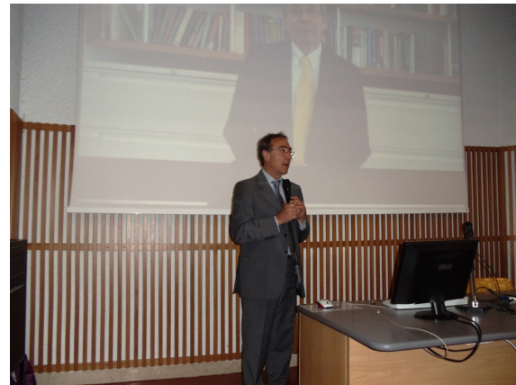
Figure 1 A video from the Principal of King's College London was played in response to the address by the Vice Rector from Brescia University