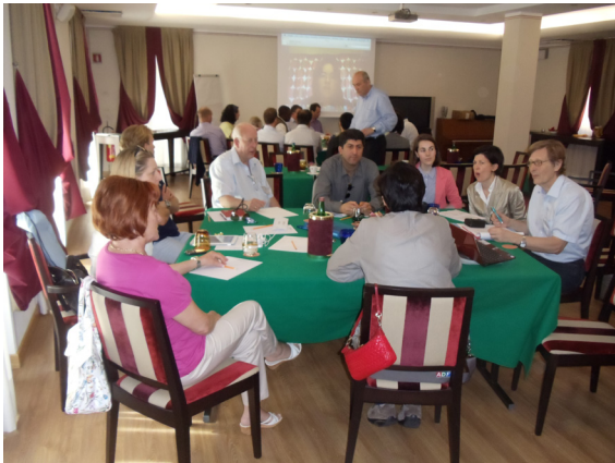
Figure 6 PIONEER Round Table