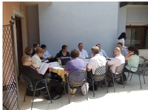
Figure 5 Ukraine Round Table