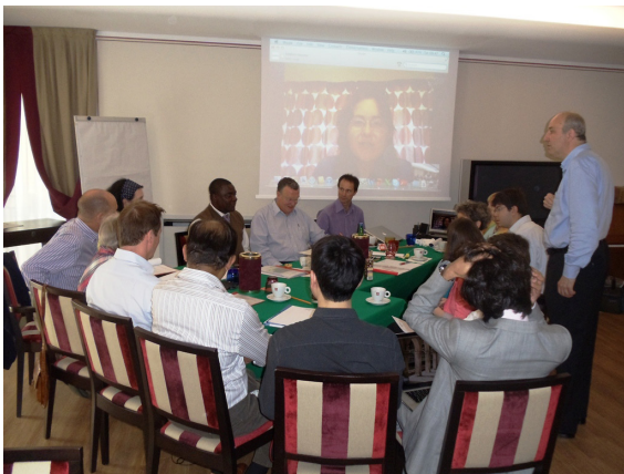
Figure 4. Malawi Round Table