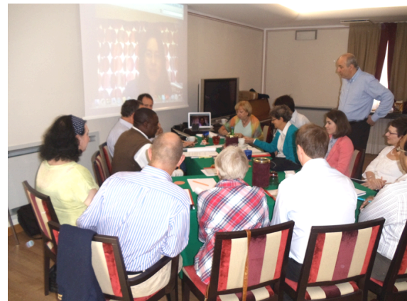
Figure 1. Round Table for Malawi