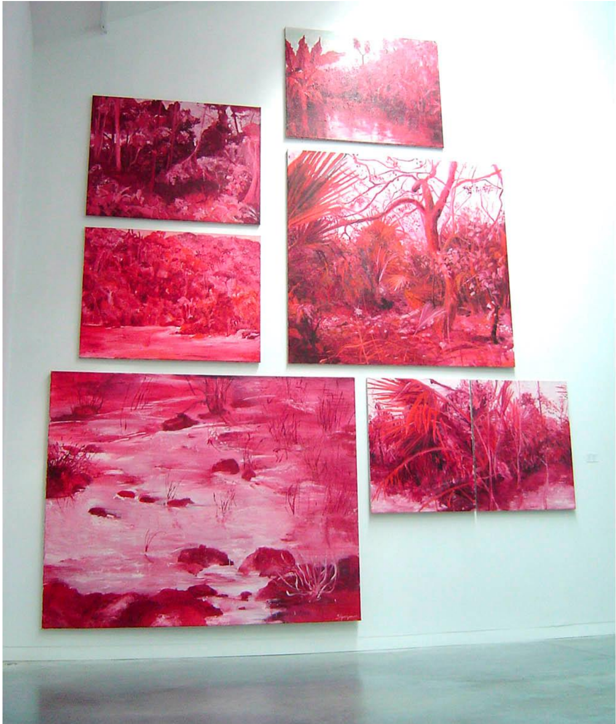
Red forests, Soazic Guezennec, Exhibition view, Aujourd'hui le paysage Centre d'art contemporain de Lacoux 2004.

The preservation of nature is today a major political issue. Should art take part in the citizen's debate and claim to contribute to inspire a change? Or is it presumptuous and vain for an artist to claim to want to heal the world? If artists are the antibodies of society, then doesn't the current state of the world reveal a real deficiency of art as an immune system?