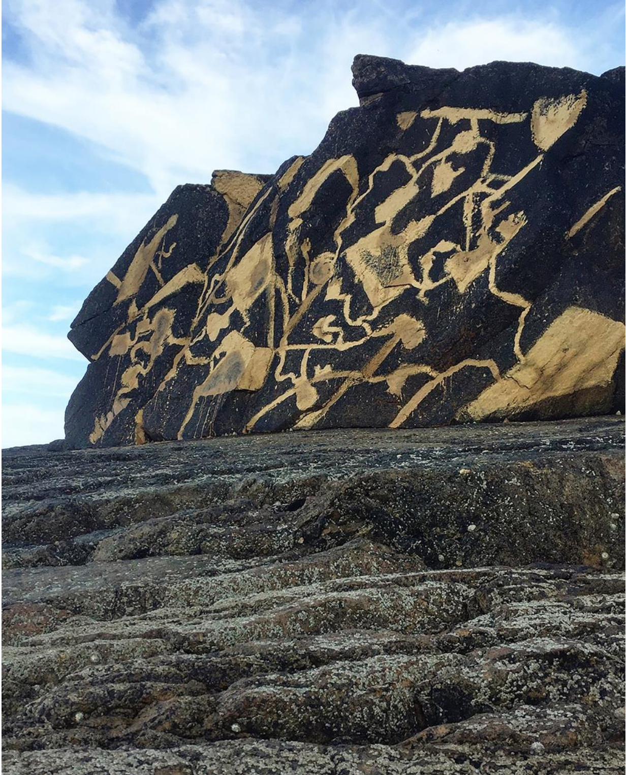
The map to the secret cave Clay- Rocks 48°42'17.6"N 3°43'02.1"W 2018. Soazic Guezennec.

promotes these utopias by hacking the communication vectors of the real estate industry. Supported by Columbia University, GSAPP, “Happy Owners” has opened 10 branches in India, one in Turkey and one in Germany, each time using a local context to suggest housing transformations. The objective of “Happy Owners” is not to provide solutions, but to raise questions and to promote utopias that can inspire reality.