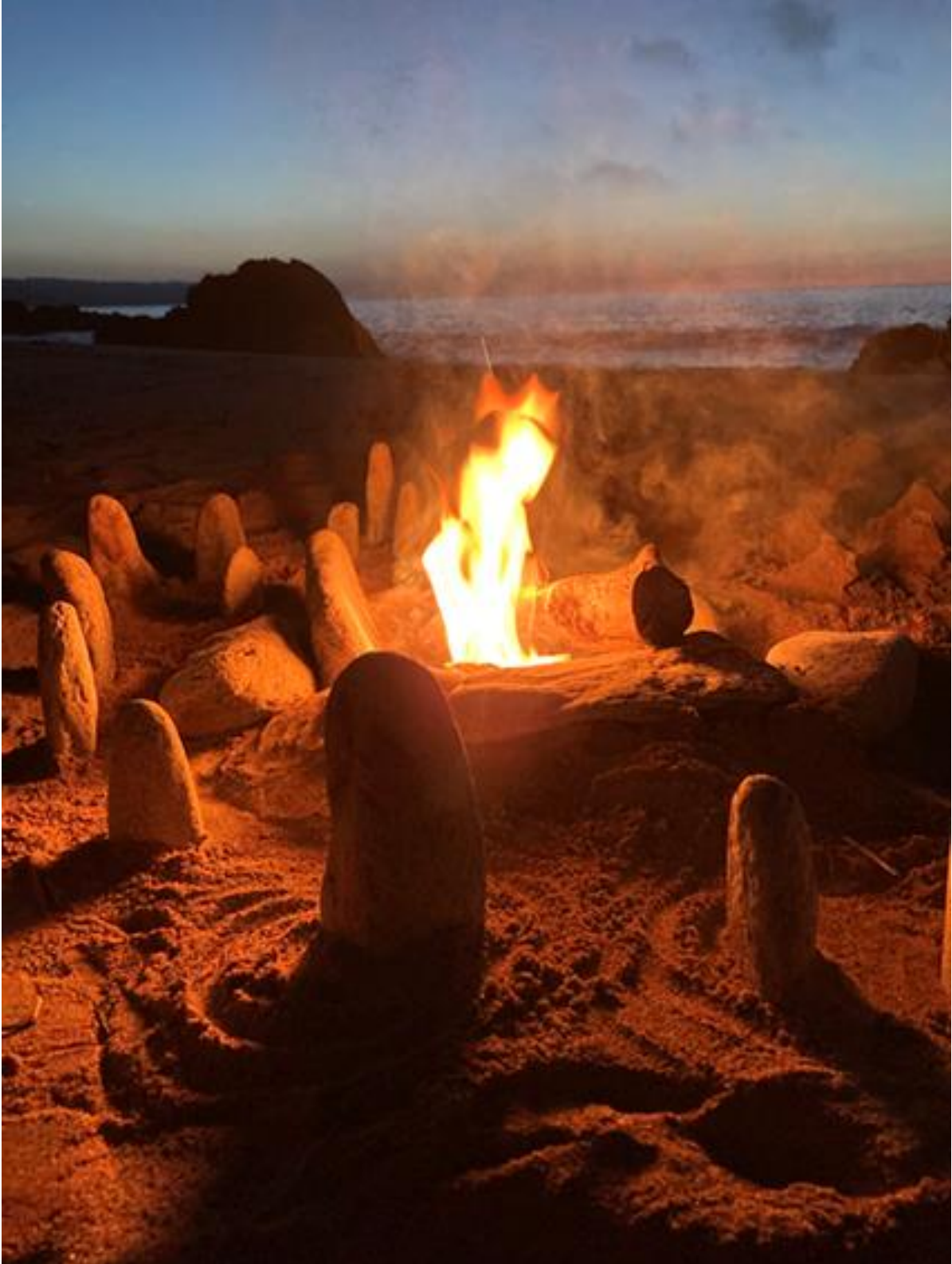
A day on Earth, Fire, Soazic Guezennec.

The way the work is perceived, or the use that is made of it, seemed to me superfluous. I do not create for a certain public, to awaken consciences, or to inspire change. I only create out of need, the desire, a way of seeing, a need to translate the world in a sensitive language to make it bearable; I create to detect the world's mysteries and to evaluate my place in this complex mesh.