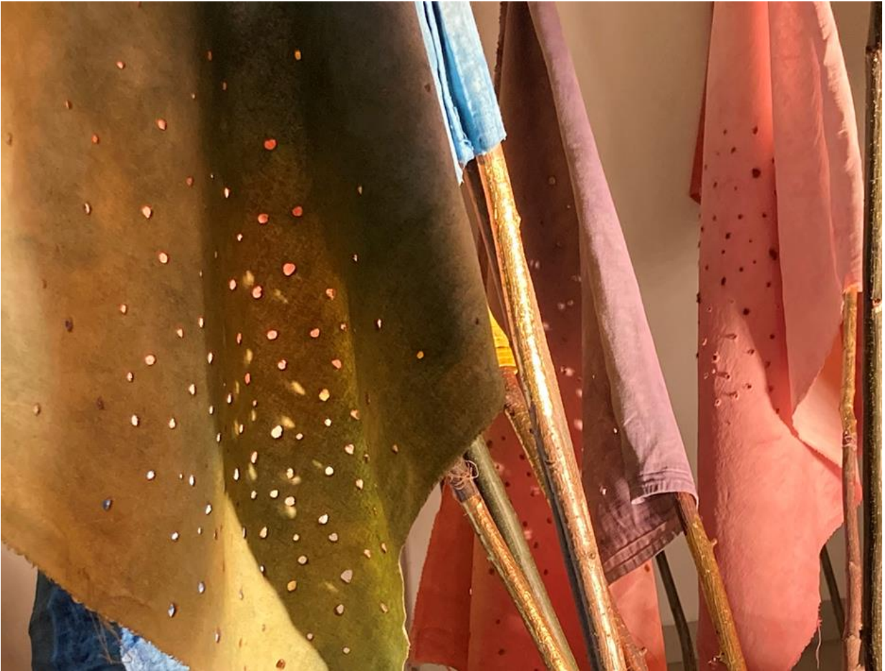
Restitution of earth to the stars, Soazic Guezennec.

For more than 20 years I have been representing wounded landscapes in order to make the public aware of the fragility of nature and to invite them to assume their responsibilities and take action. The period of the COVID-19 pandemic has awakened doubts and questions about the meaning of all this: Is it really the role of art to substitute itself to politics in an attempt to rethink our relationship with nature? Is it even desirable to attribute a function to art? During this period, there was an increasing expectation to diffuse a supposed artistic antidote to the unedited situation in which we lived on social media networks. Since the resumption of exhibitions and residencies, calls for applications including proposals for workshops, mediation spaces, and collective works on ecology have become commonplace. Despite the opportunities to participate, this frenzy has awakened in me a feeling of helplessness and has led me to question my artistic desire.