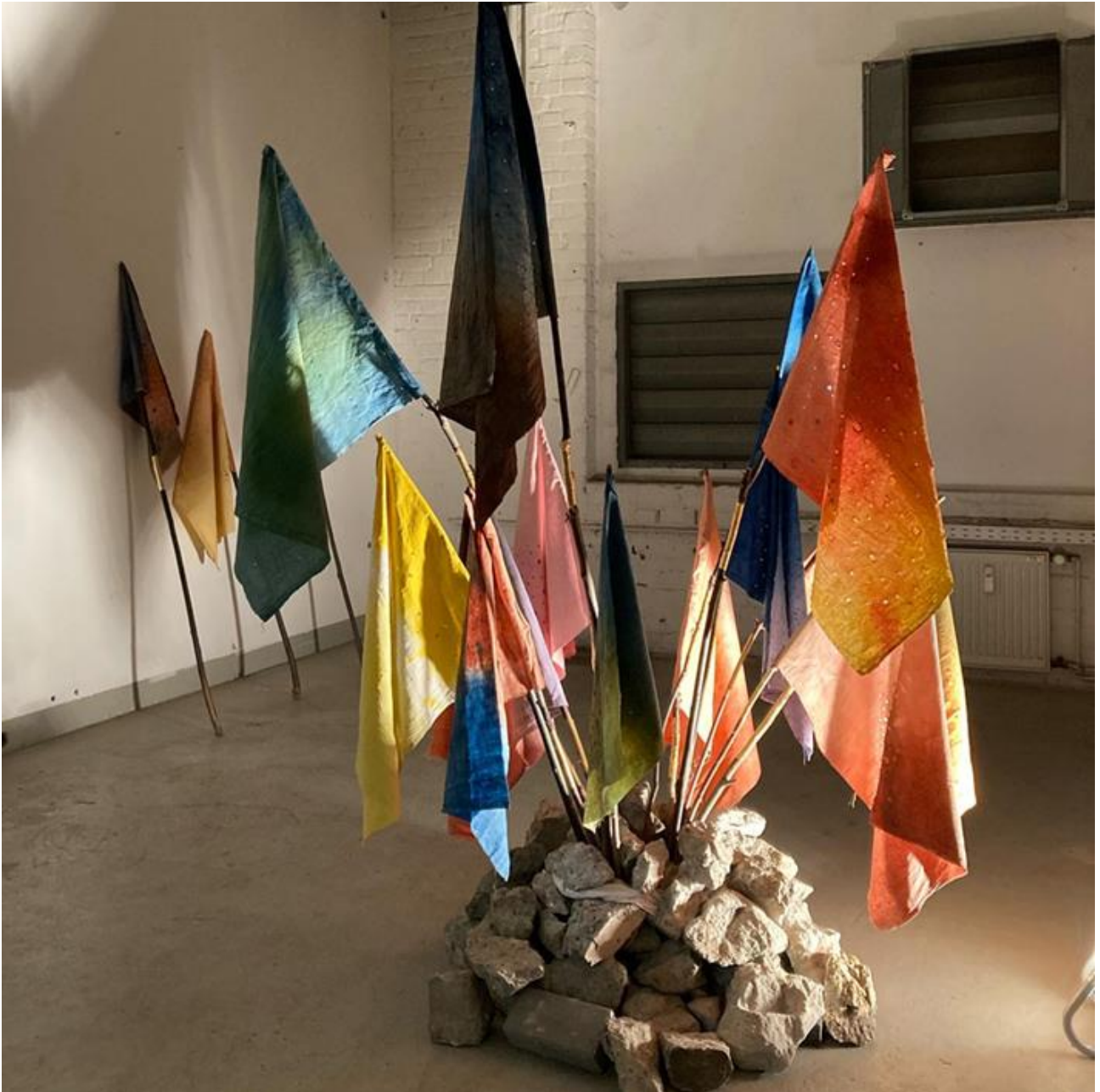
Restitution of earth to the stars, Soazic Guezennec. Image courtesy of the artist.

The same motivation inspired the performance installation "restitution from the earth to the stars." The installation presents a bouquet of flags planted in a pile of rubble. The flags are made of dyed pieces of fabric with holes in them. Participants are invited to plant the flags in the landscape, allowing light to pass through the holes to make a constellation appear. The gesture of planting a flag, which usually marks the conquest and possession of a territory, is diverted to signify a renunciation and a restitution. By planting the flag, each participant reconsiders his or her position on earth, under the sky, and in the cosmos and agrees to initiate the decolonization of nature.