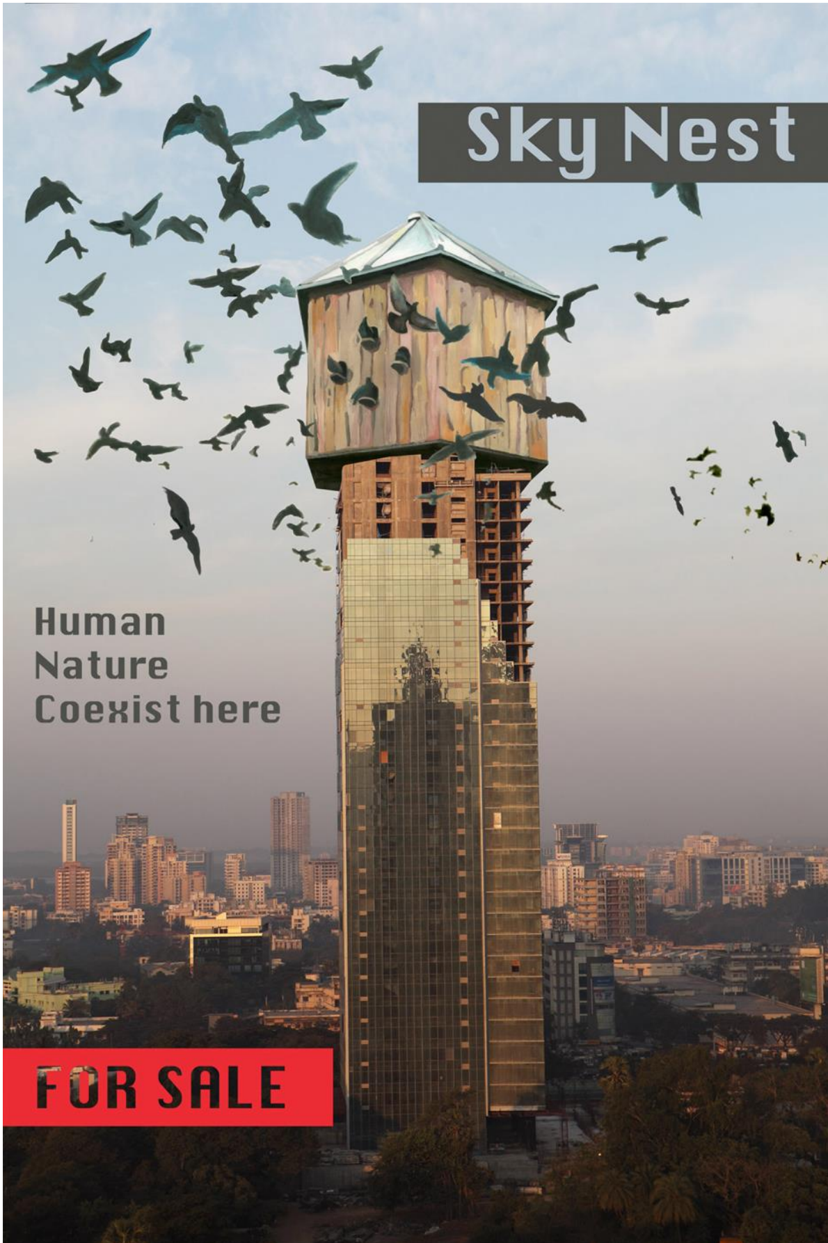
Happy Owners India, Soazic Guezennec.