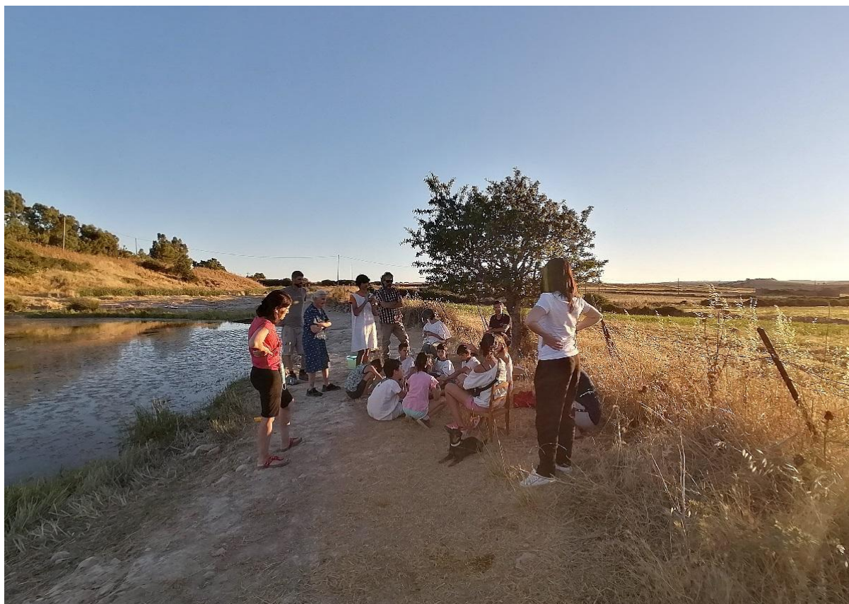
Fig 5. Collection of the clay in the small lake of Cucurru de Omusu .

The extraction of the clay and the cleaning and removal of the impurities were done with the help of some kids from Nurri. It followed on the “People of the Earth” walk to the top of the Mount Pitziogu, the crater of an old volcano, where the work was installed. The People of the Earth represented a small community of people who symbolically watch over the territory of Nurri as primordial presences and ensure, like ancient guardians, that the miracle of creation comes to no harm.