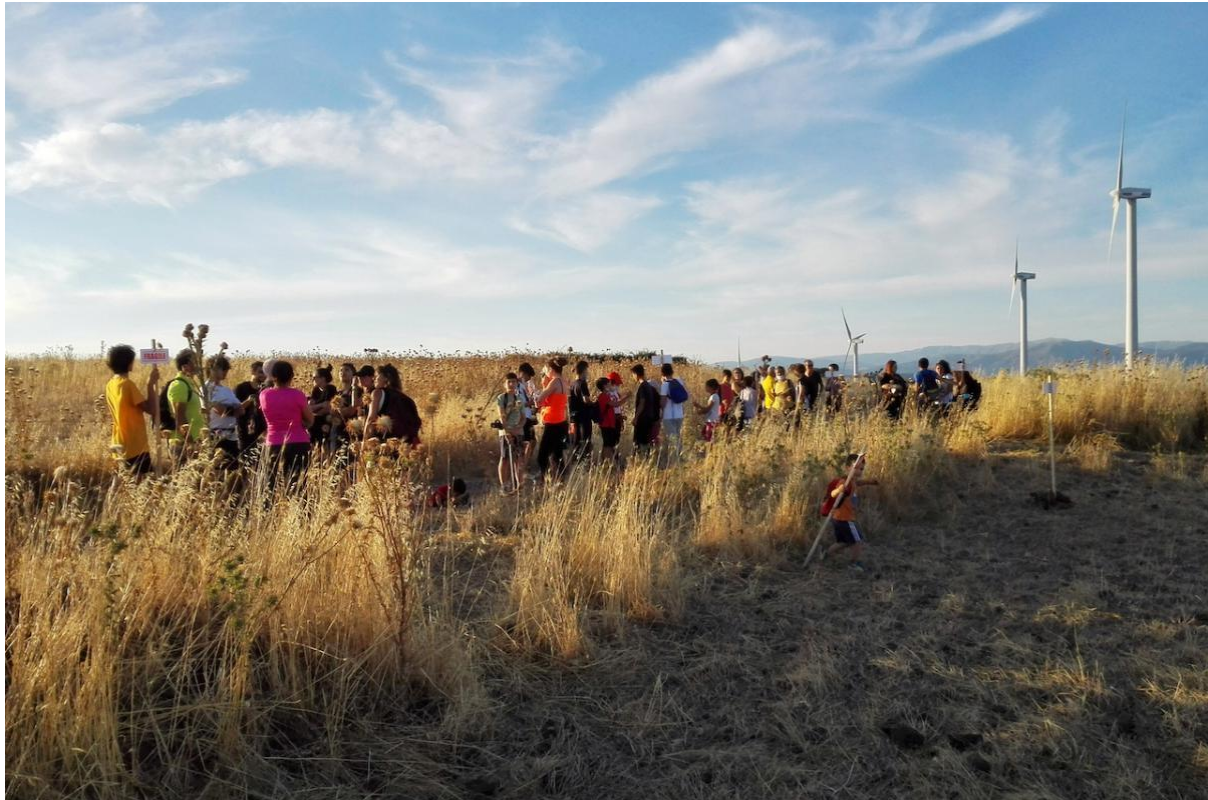
Fig.3 Walking performance Fragile.

For the realisation of the artistic works there we needed to know the land, to get closer to its geography, and we also aimed to respect the place and the culture of the people living there. The works had a character of protection, defence and garrison and also a sacral approach with the quest to rediscover the very identity of those places and to inhabit them, in an attempt to respect the Genius Loci “to maintain a congenial balance between natural elements and cultures, as multiple representations of being” 11