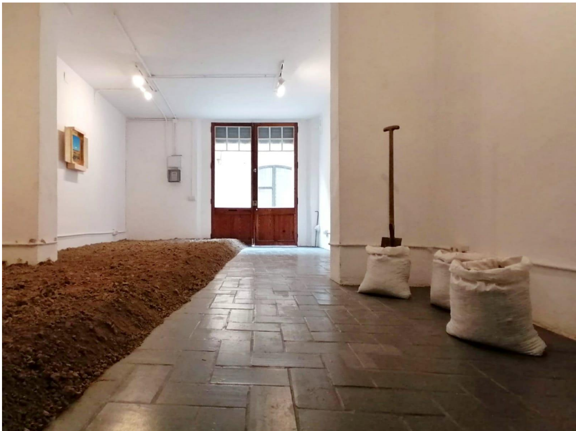
Fig.7 Part of the exhibition Fragile in the Gallery Espai Souvenir.