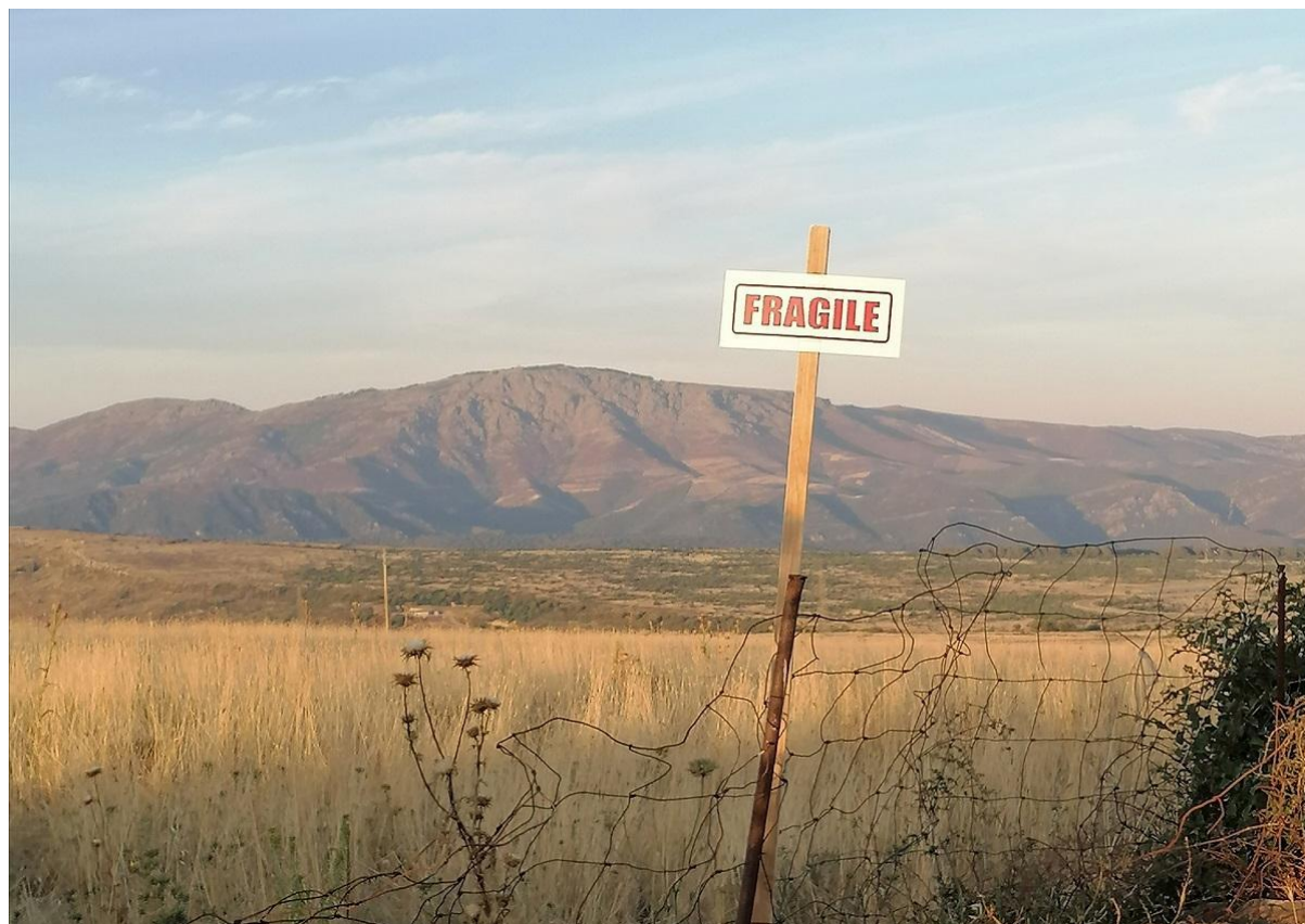
Fig. 4. One of the 22 signboards placed during the walking performance Fragile .

pasture, and is separated by stone walls and padlocked gates. In the previous days the artists had contacted the owners, asking for permission to walk in those lands. The initiative was also supported by owners, tenants, and shepherds who even opened the gates and moved the flocks in order to make access easier. This interaction and the participation of the population were fundamental for the realisation of the special walk.