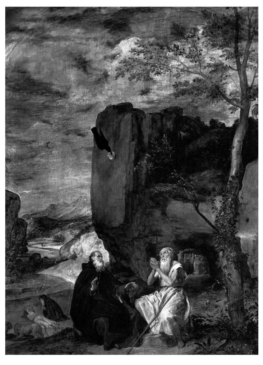
3. Velázquez, Landscape with St. Anthony Abbot and St. Paul the Hermit, c. 1634, oil on canvas, 257~\mathrm{cm}\times188~\mathrm{cm} , Museo del Prado, Madrid.

poetry and landscape painting. Furthermore, it shows how nature and its perception as landscape was both a source of delight and a stimulus for moral reflection.