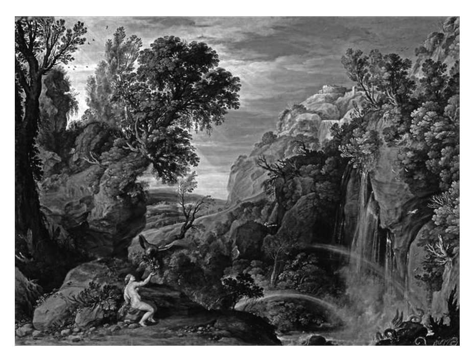
5. Paul Bril with Peter Paul Rubens, Landscape with Jupiter and Psyche , 1610, oil on canvas, 93 cm × 128 cm, Museo del Prado, Madrid.