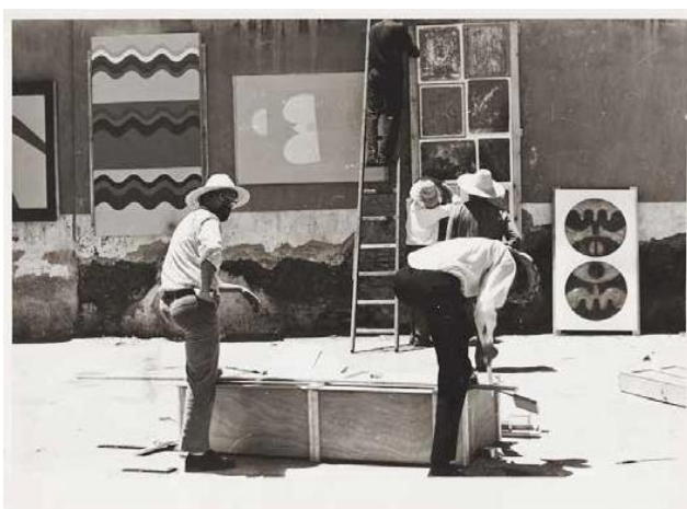
Figure 2: Exposition-Manifeste/Présence Plastique , Place Jemaa el-Fna, Marrakech, 1969.

Deleuze and Guattari align the insights of this moment with the capacity of capitalist desiring production to fragment and recouple. “No one has ever died from contradictions. And the more it breaks down, the more it schizophrenizes” (1994, p. 151). Deleuze and Guattari argue racialisation integrates non-white indigenous populations as a divergence from the generalised schema of the White-Man face whose model is the image of Christ. All faces are constructs, intersections of signification (white wall) and subjectivity (black hole). “From the viewpoint of racism, there is no exterior, there are no people on the outside. There are only people who should look like us and whose crime it is not to be” (2007, p. 197). Racialisation is an interplay (rhythm) of polyvocal subjectifying forces, or pulsating “backward waves” (p. 197), subject to binary organisation upon the facialisation machine. The counteraction of de-facialisation returns subjectivity to an experimental state and reterritorialises a “new set of artifices” (p. 193). Deformations of facialisation scramble the binary parameters of white (superior) and non-white (inferior) identity, delegitimising colonial ideologies, creating space for the formation of postcolonial nationalities.