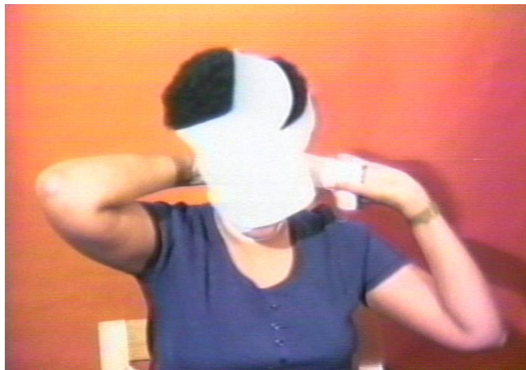
Figure 5: Howardena Pindell (1980), Free, White and 21 . Single-channel video (colour, sound; 12:15 minutes). Courtesy the artist and Garth Greenan Gallery, New York

When I was in kindergarten, I had a teacher who was not very keen on black students. There were very few of us possibly two in the kindergarten class, out of a class of perhaps forty. During the afternoon hours we were given a time to sleep. Each of us had our own cot and we were told if we had to go to the bathroom, we should raise our hands, and one of the teachers would take us to the bathroom. I raised my hand, and my teacher flew into a rage, yelling ‘I can’t stand these people’, and took out sheets and tied me down to the bed. She left me there for a couple of hours, and then finally released me. One of the students filed a complaint, perhaps to a parent who did not know I was black, perhaps the child did not know or had not learned to differentiate race at that point in time. I later found out that that teacher had been fired for bothering a student. Perhaps I was not the first one. (Pindell, 2020, n. p.)