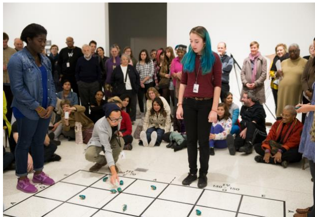
Figure 3: Benjamin Patterson (1962), Pond .

Benjamin Patterson distills the diffractive flux of schizopedagogic counter-waves into sound actions. His Variations for Double-Bass (c. 1962) is a demonstration comprising a series of “[p]itches, dynamics, durations, and number of sounds” (Patterson, c. 1962) that approaches the instrument’s body without organs. The performer improvises Patterson’s score, preparing the instrument with a sequence of objects—clamps, clips, pegs, and paper strips, etc.—plucking, bowing, rubbing, or agitating it to examine the double-bass’s sonic potential. Patterson set out to become “the first black to ‘break the color-barrier’ in an American symphony orchestra” (2012, p. 110), but upon meeting John Cage and David Tudor in 1960, he shifted focus towards experimental practice and became central to the formation of Fluxus in 1962.