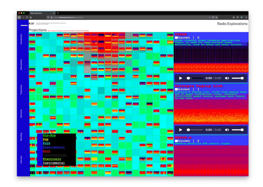
Figure 4. 'Data Observatory: Projections': Signals are 'projected' onto a pre-organized map of musical samples, labelled according to the genre (overlay, bottom left). Each genre 'highlights' some cells among which certain radio signals can be found. Highlighted here is the 'Hip-Hop' genre. Visit the web-interface online <a href="https://radioexplorations.ch/projections/">https://radioexplorations.ch/projections/</a> (accessed on 17.02.22).

'unknown' to a 'known' signal from the database. In radio amateur practice, this is done by careful observation of different signal properties by someone who has already 'seen' and 'heard' a large number of signals, and understands patterns left by different communication protocols. I propose to work differently: to find a plane of similarity, in comparison to which I can establish similarities between signals in projections and reflections off of a different kind of data. Now, it becomes relevant how radio signals samples are placed next to each other: a direct similarity between radio signals on the map should reflect their likeness in an aspect that is shared with audible information on music.