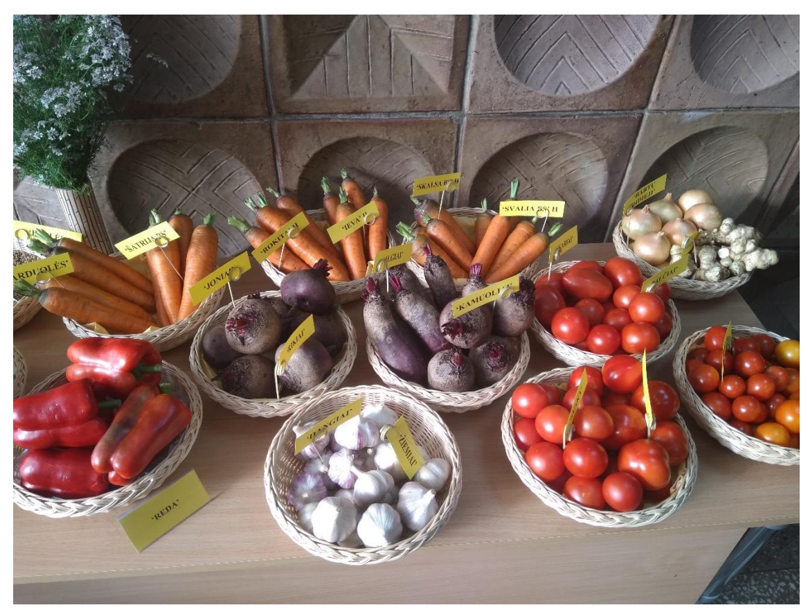
Figure 1. Exhibition of local vegetable varieties for educational purposes (Lithuania).

Rural tourism homesteads play a significant role in promoting gastronomy tourism in the Baltic countries. Baltic Country Holidays (2014) published the manual of rural tourism in Latvia. They suggest to enjoy rural holidays staying at country homes, farms, cottages, campings and manor houses. Tourists can get tasty home-made meals from local products, eat fruits and berries grown at the garden, feed and cuddle the farm's animals. The company also helps to organize individual self-drive tours, gastronomy tours for groups, children summer camps, rural tourism and agricultural study tours.