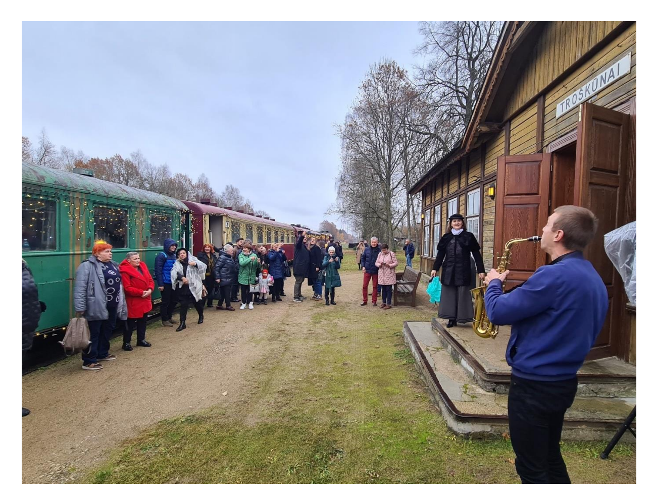
Figure 3. Passengers on the gastronomy train tour going to Troškūnai train station to taste local dishes.