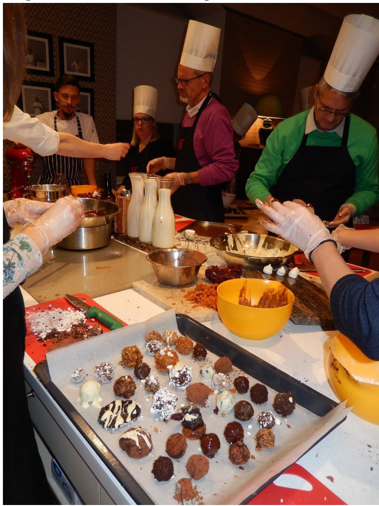
Figure 4. Cooking Workshop in Riga. Preparation of Desserts.

Various tastings and educations are especially popular in rural areas. Educations could include and such actions as food preparation with locals and cooking workshops (Figure 4). Tastings are especially popular in regional wineries, breweries, milk processing companies, where could be organized food and drink tasting sessions of wines, beers, or cheeses.