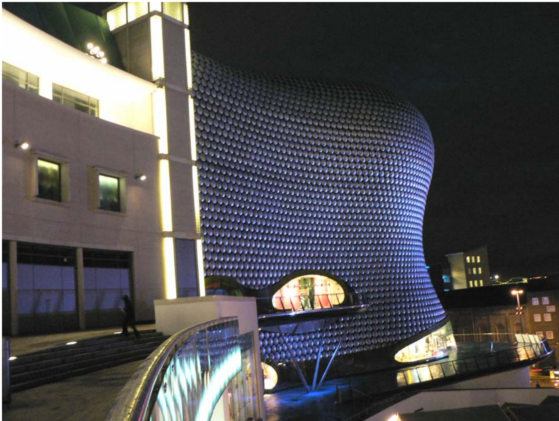
Selfridge's Building in Birmingham

Some authors have announced the death of the public space. It is not for missing. The comfort and security of the commercial centres is operating as a revulsive to the management of the risk that, daily, we should practice in the public "real space", the street.