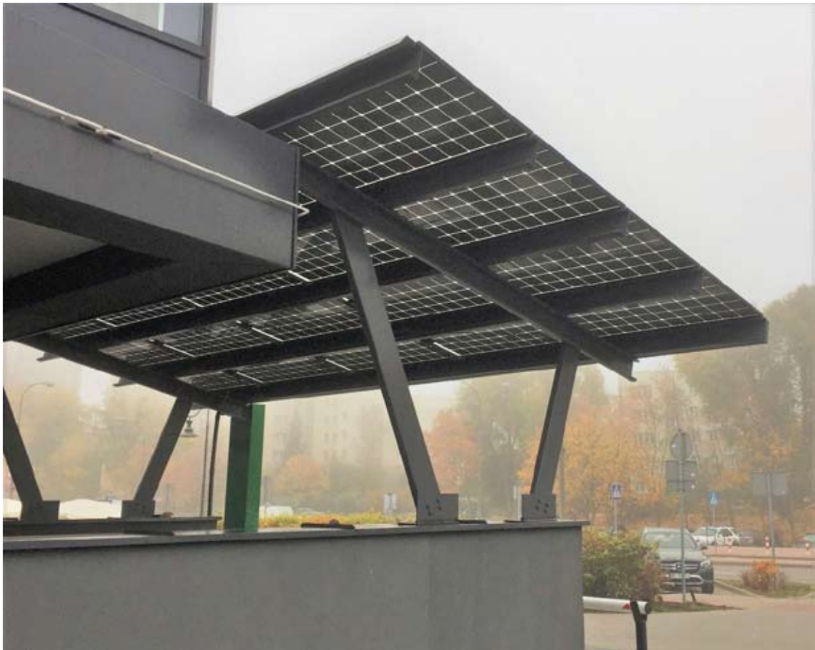
Figure 1. The roof of the entry ramp uses aesthetic photovoltaic modules in transparent glass-glass technology and also fulfills aesthetic expectations. The south-eastern elevation supports the energy balance of the building in an architecturally considered way.