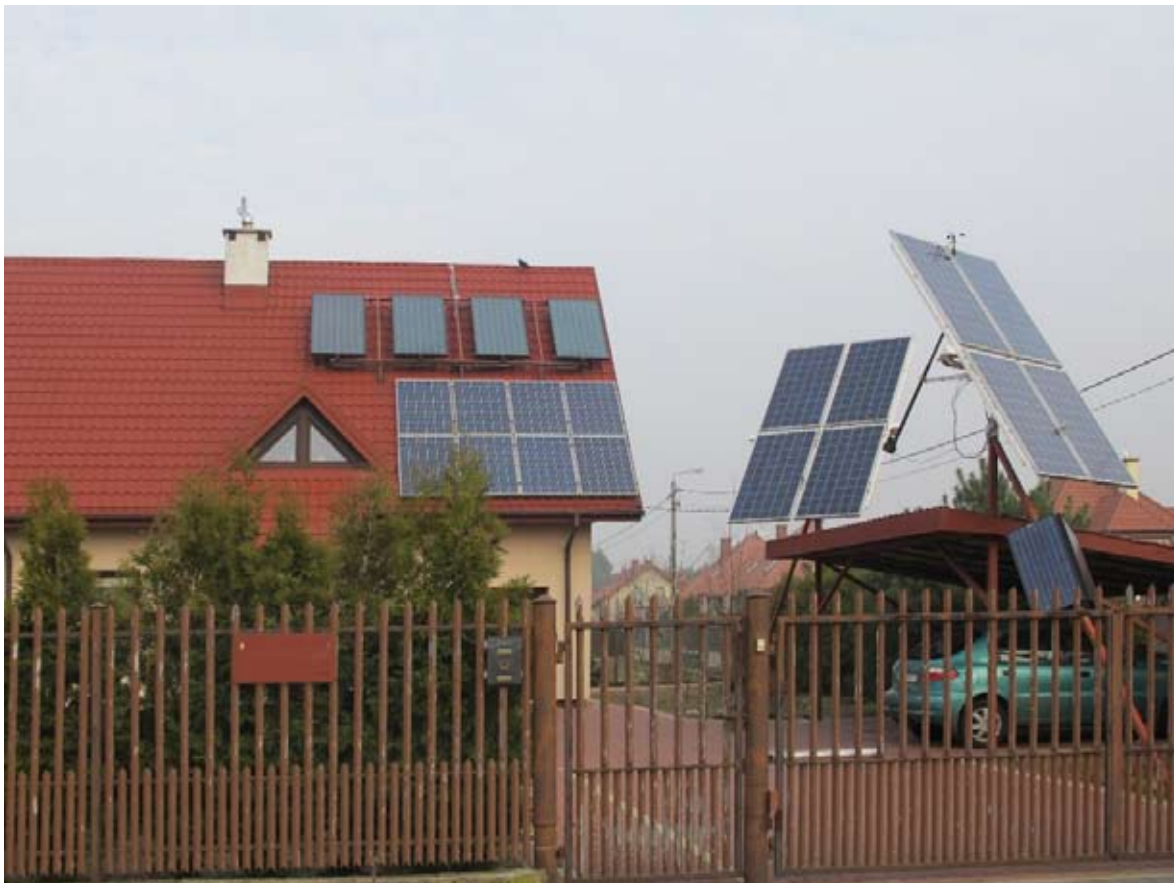
Figure 3. Solar and photovoltaic installation on the roof and property of single-family houses in the commune near Warsaw.

The increasing awareness and widespread use of solutions for obtaining energy from the sun is demonstrated by suburban housing developments, whose roofs are increasingly used for solar panels or photovoltaics. Both technologies are often confused by the uninitiated viewer due to the similarity of form and presence. In both cases, these are usually rectangular panels, placed on roofs facing south-west, at an angle close to 35°. It should be noted that promotion of these solutions using EU and government subsidies takes minimum consideration of aesthetics. As a result, financially supported solutions give the impression of being added to the object, without any care for landscape values (Figure 3).