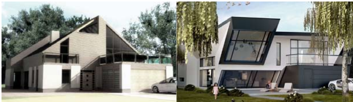
Figure 4. Two buildings with the same floor plan. A typical suburban single-family house (picture on the left). A building optimized in terms of relation with lights and the influence of the sun as an alternative to a typical detached suburban housing development (picture on the right). [Jolanta Szczepanik, „Sustainable development and environment in the context of suburban development”, MA thesis, Faculty of Architecture, Warsaw University of Technology].

that it has become a tool in the didactic process of many universities, including architectural faculties. Thanks to the effort of users so many useful tools are created in Grasshopper, both analytical tools and those related to the creation of modern spatial forms.