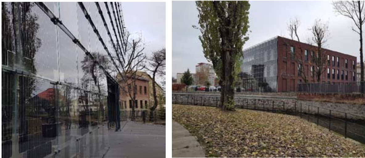
Figure 2. The southern wall and roof of the Voivodship Fund for Environmental Protection and Water Management in Gdańsk has been covered with photovoltaic panels.

Similarly, implementation of environmental policy promoting energy-saving solutions in public buildings has begun in Poland at the state level and voivodships or communes. A good example of this is the new headquarters of the Voivodship Fund for Environmental Protection and Water Management in Gdańsk, where pro-ecological solutions have been successfully applied that focus on the reduction of non-renewable energy demand and on rational water management with the use of photovoltaic modules. This minimizes the negative impact of the building on the natural environment and supports the energy balance, achieving architecturally interesting expression at the same time (Figure 2).