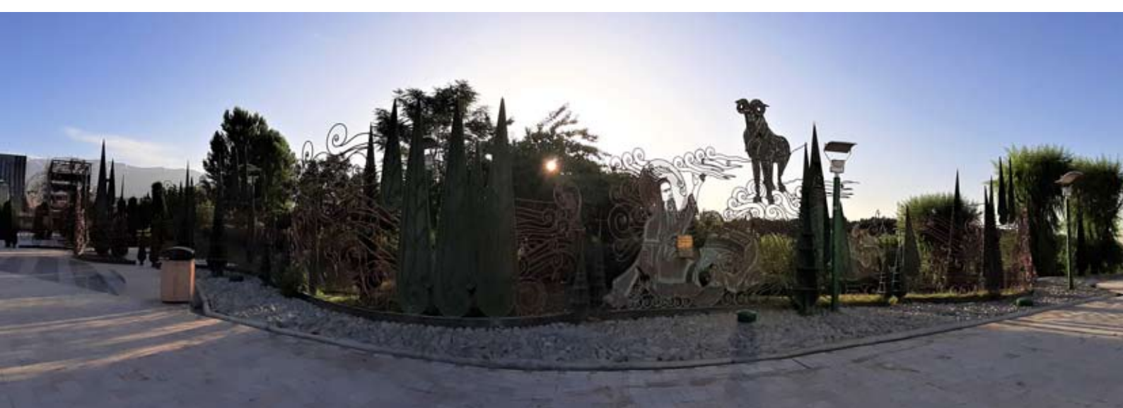
Narrative Relief of Prophet Ibrāhīm