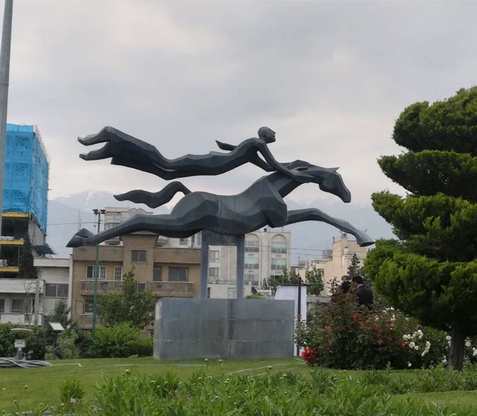
Horse and the Rider