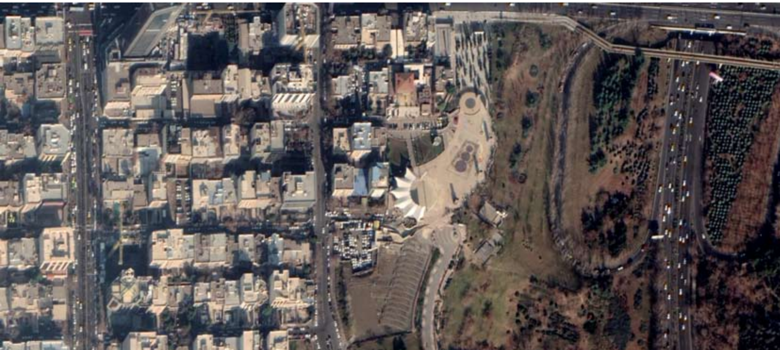
Aerial view of Tehran. In orange the location of the park. Below, View of the Āb-o-Ātash park. In- fographic: POLIS Research Centre