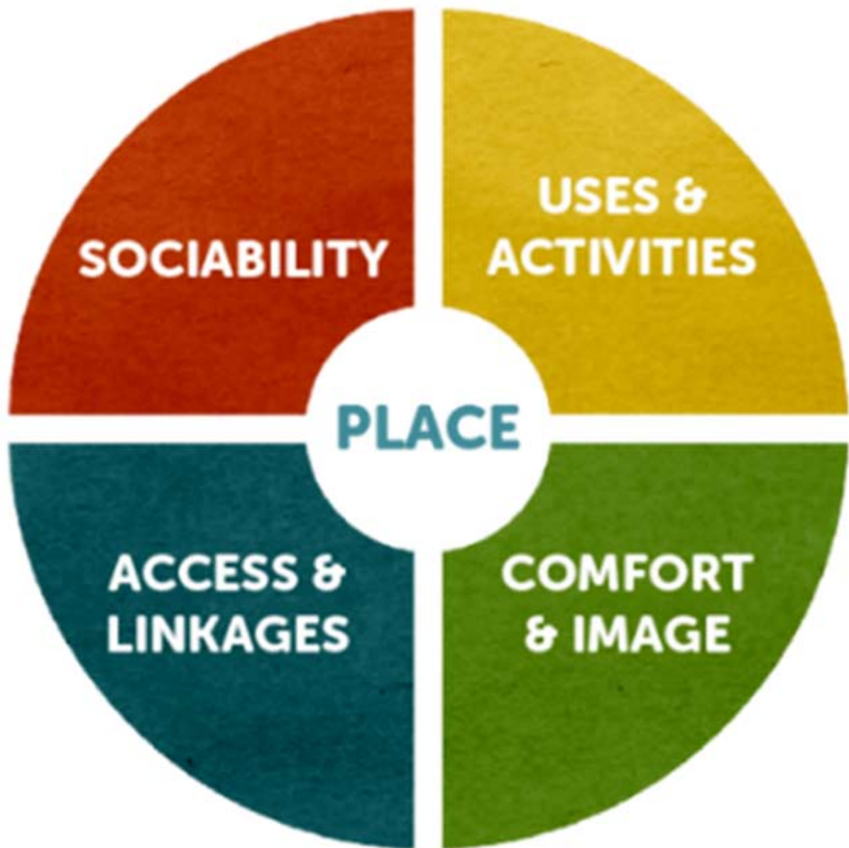
Diagram 1. PPS place diagram

In order to conduct the research, PPS diagram as the evaluation system, has herein been integrated into a subjective approach based on user experience. Principle indicators offered in PPS diagram are sociability, uses and activities, access and linkage and comfort and image. Drawing upon walking interview as a technique that allows for the engagement of informants with space and place (King & Woodroffe, 2017: 3), participants were first offered brief descriptions of each of the rating criteria, elicited from their specifications as proposed by PPS, while walking through the respective sites along with the researcher.