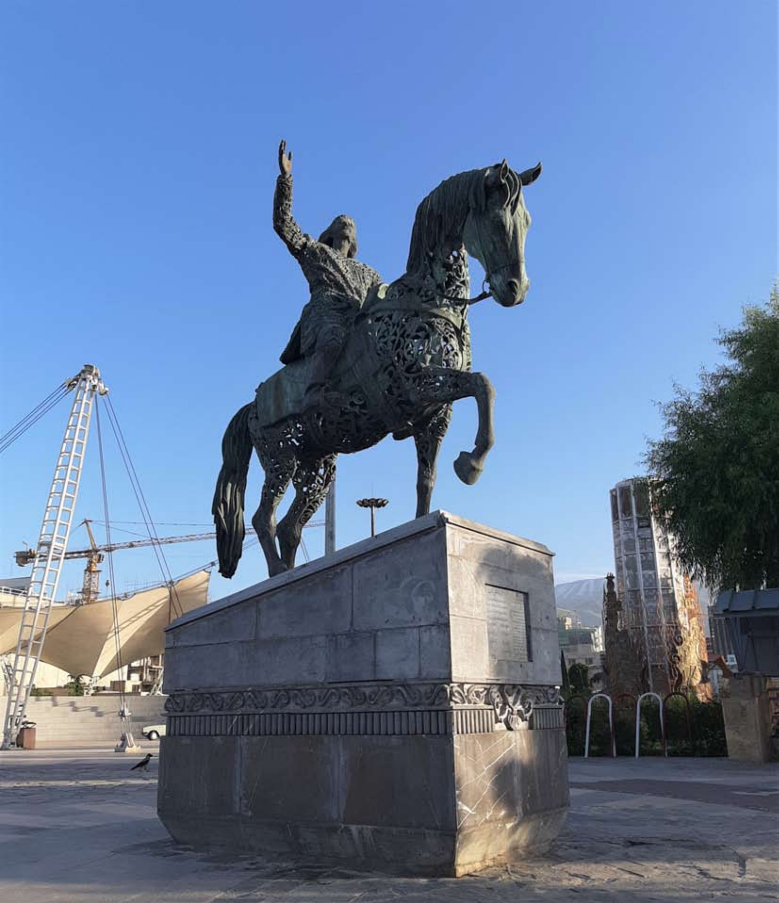
Siyāvash in Fire